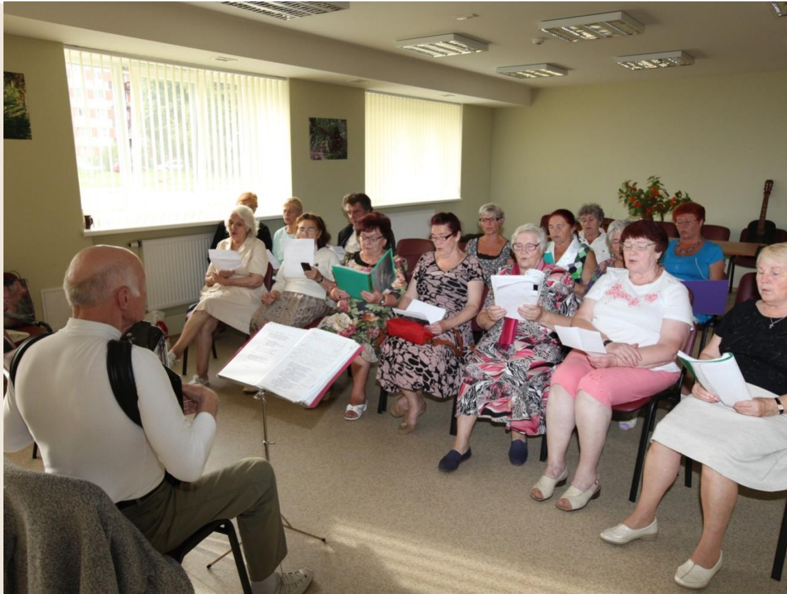
Activities at Day center for seniors