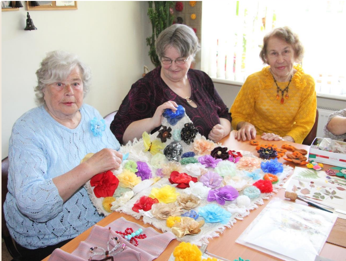
Activities at Day center for seniors