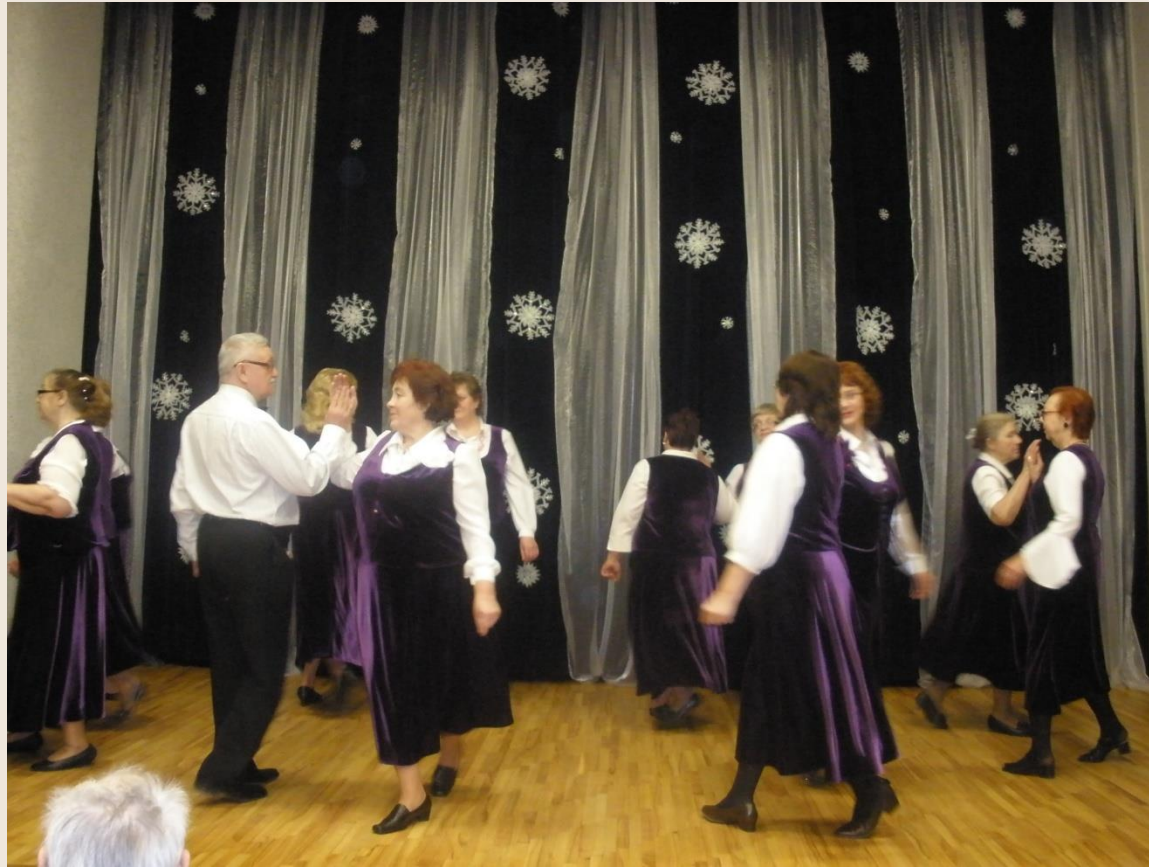
Christmas - seniors dancing