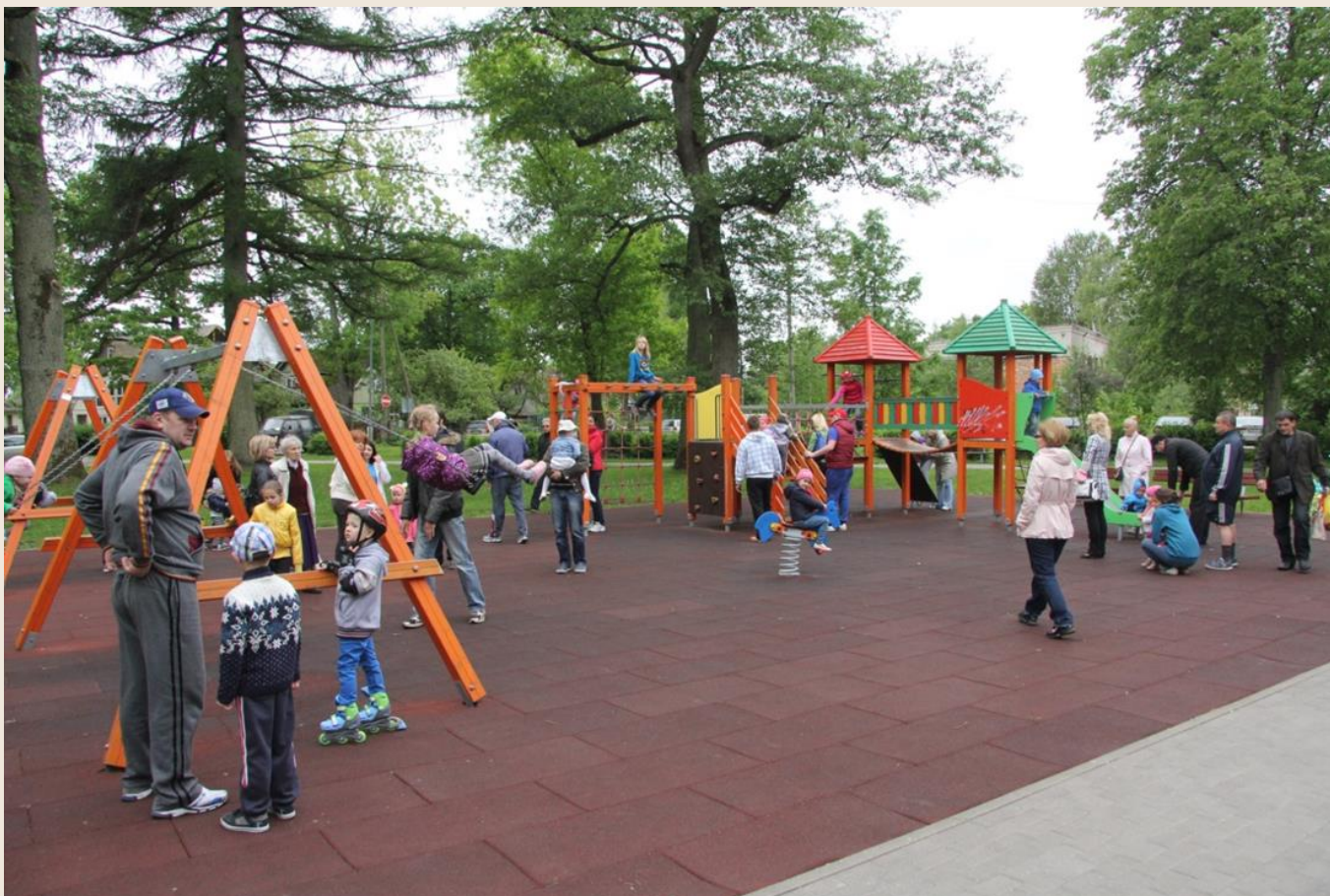
Recreation park of Melluzi- one of the most popular place among families