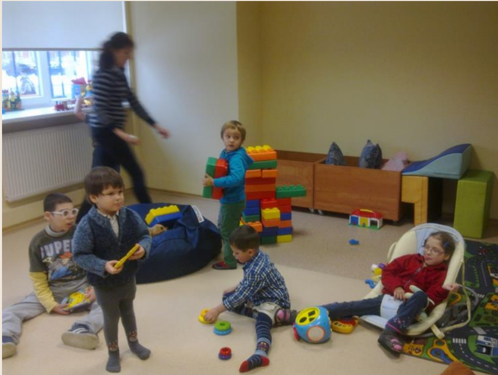
Day center for children with functional disorders