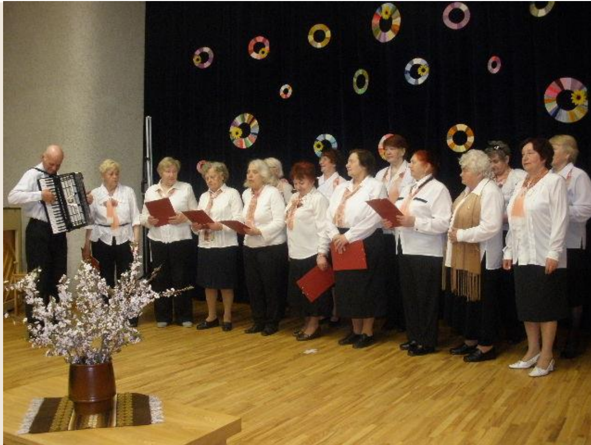
Easter at Day centre for seniors