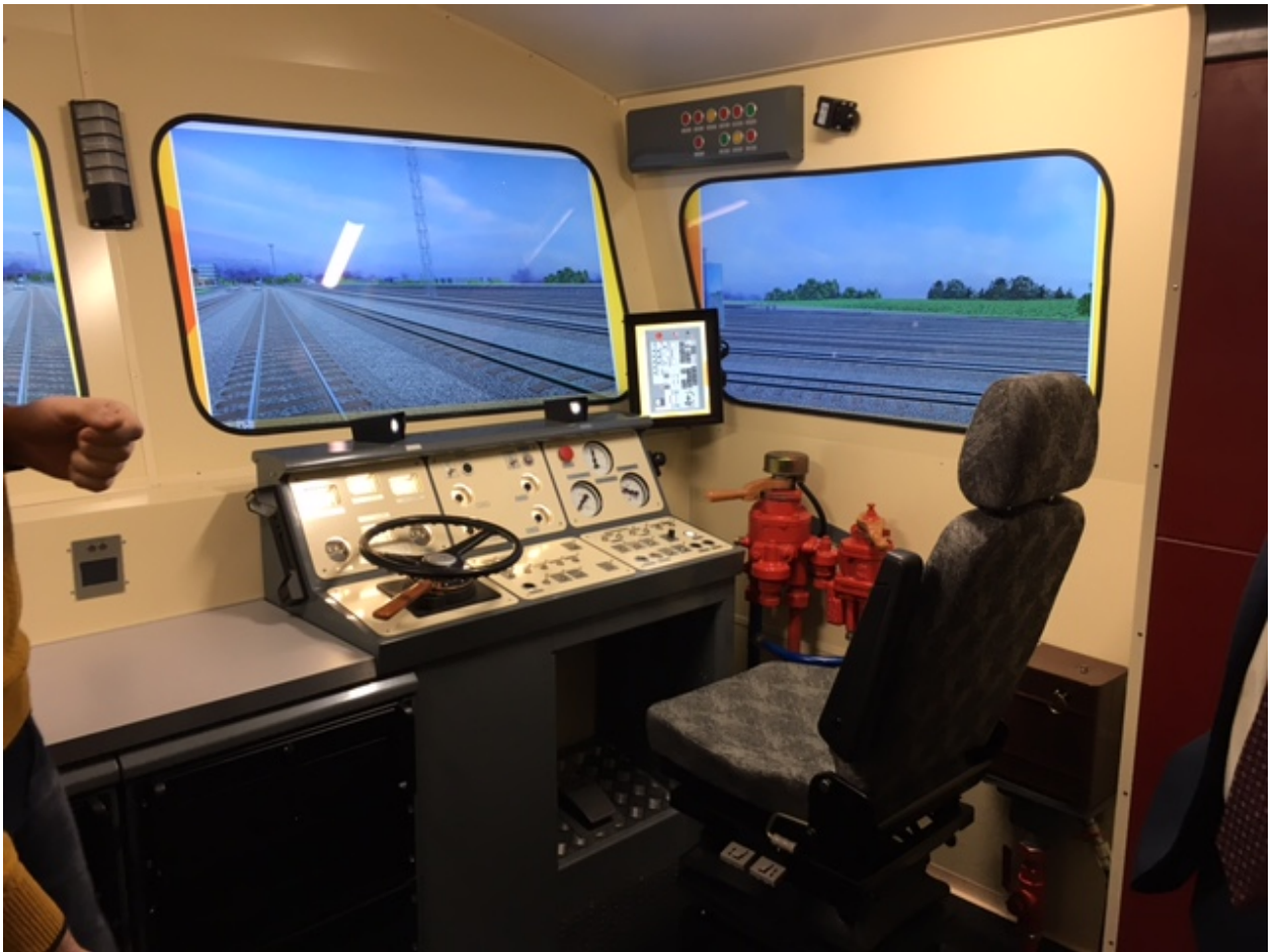
Modern 7D virtual training class