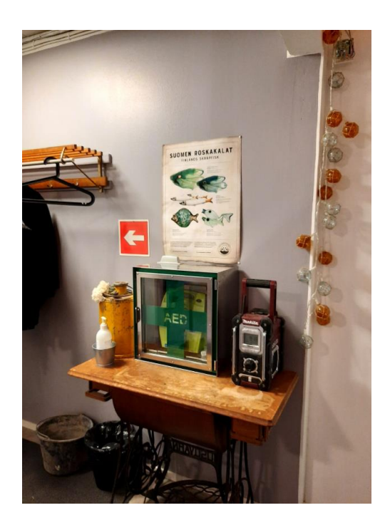
The AED defibrillator unit on Bodö.

An AED defibrillator unit was procured and placed in the harbour area.