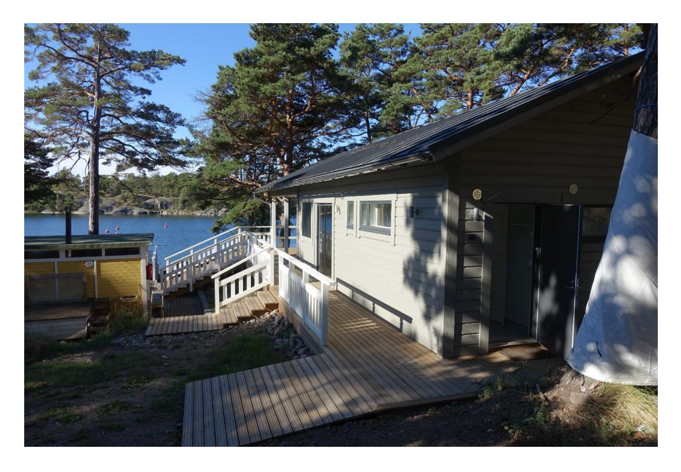
The new service building on Bodö.