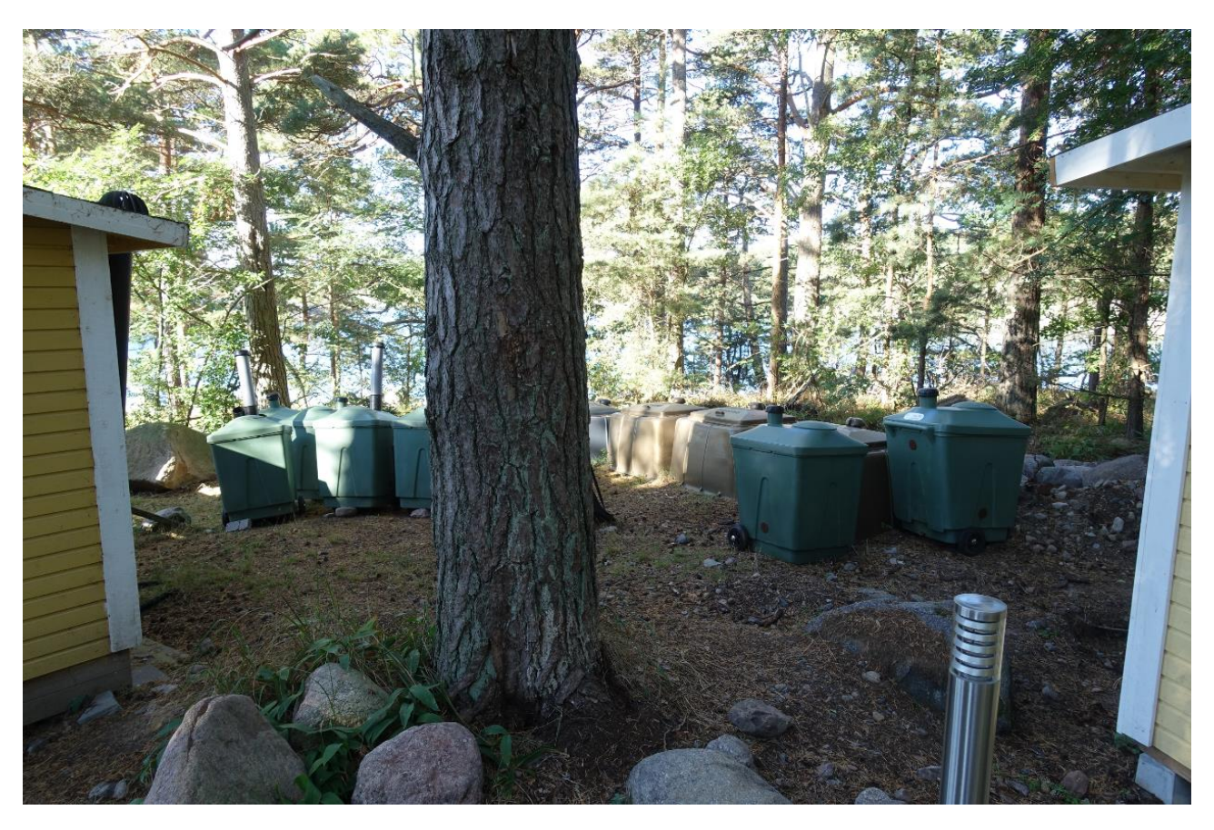
The reserve containers for the new dry toilet unit on Bodö. The lights installed in the harbour area can be seen in the photo.