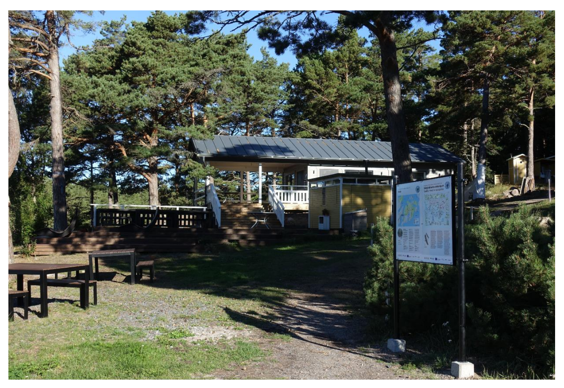
The new information boards on Bodö.

New content for the information boards was created. The new information boards were procured and installed on Bodö.