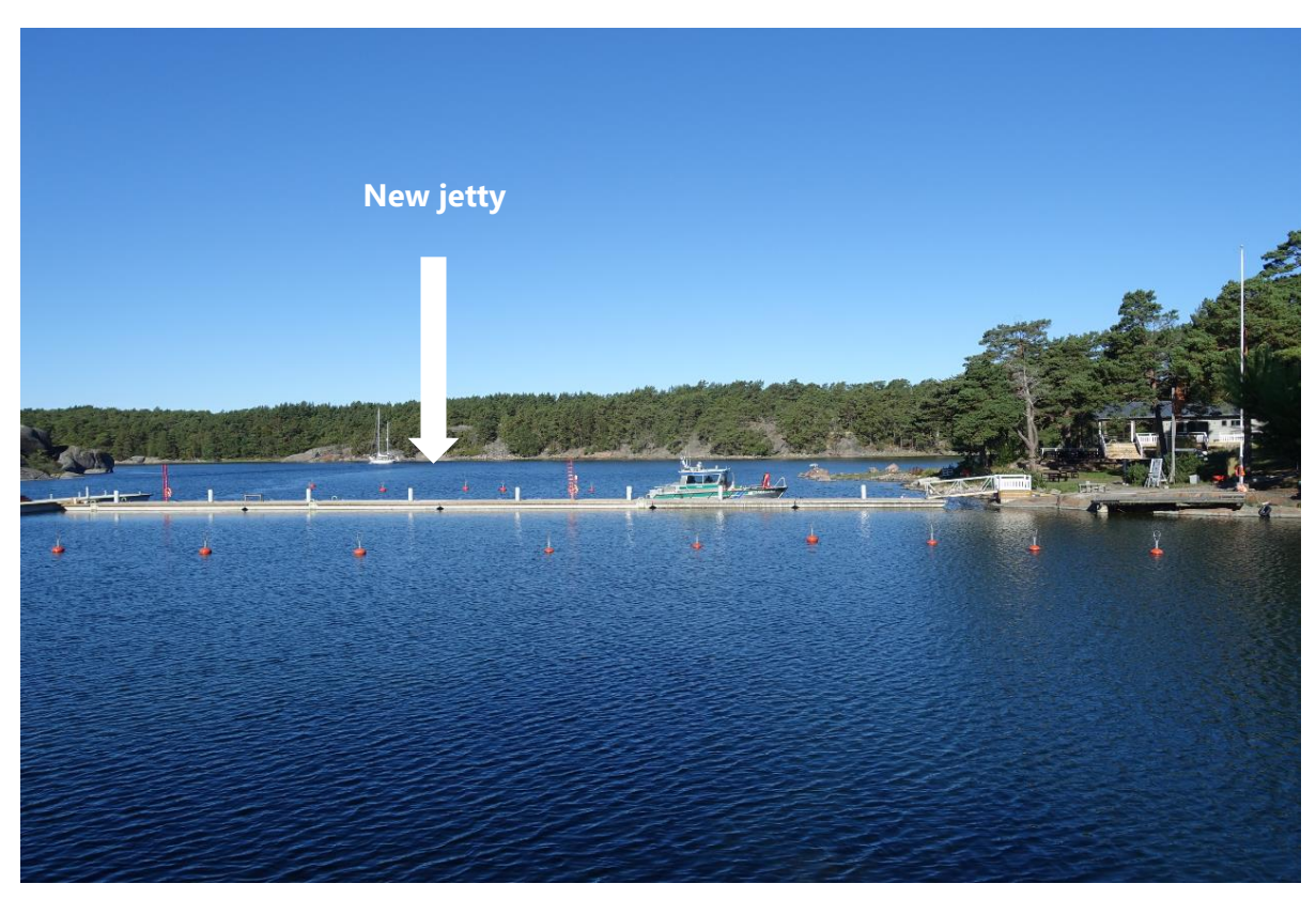
The new jetty on Bodö.