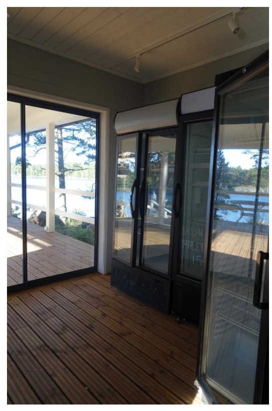
Harbour shop in the service building.