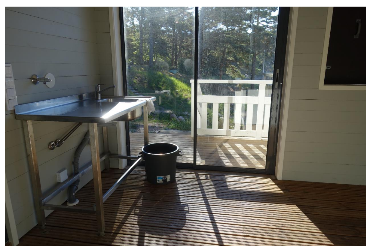
Service facilities in the service building.