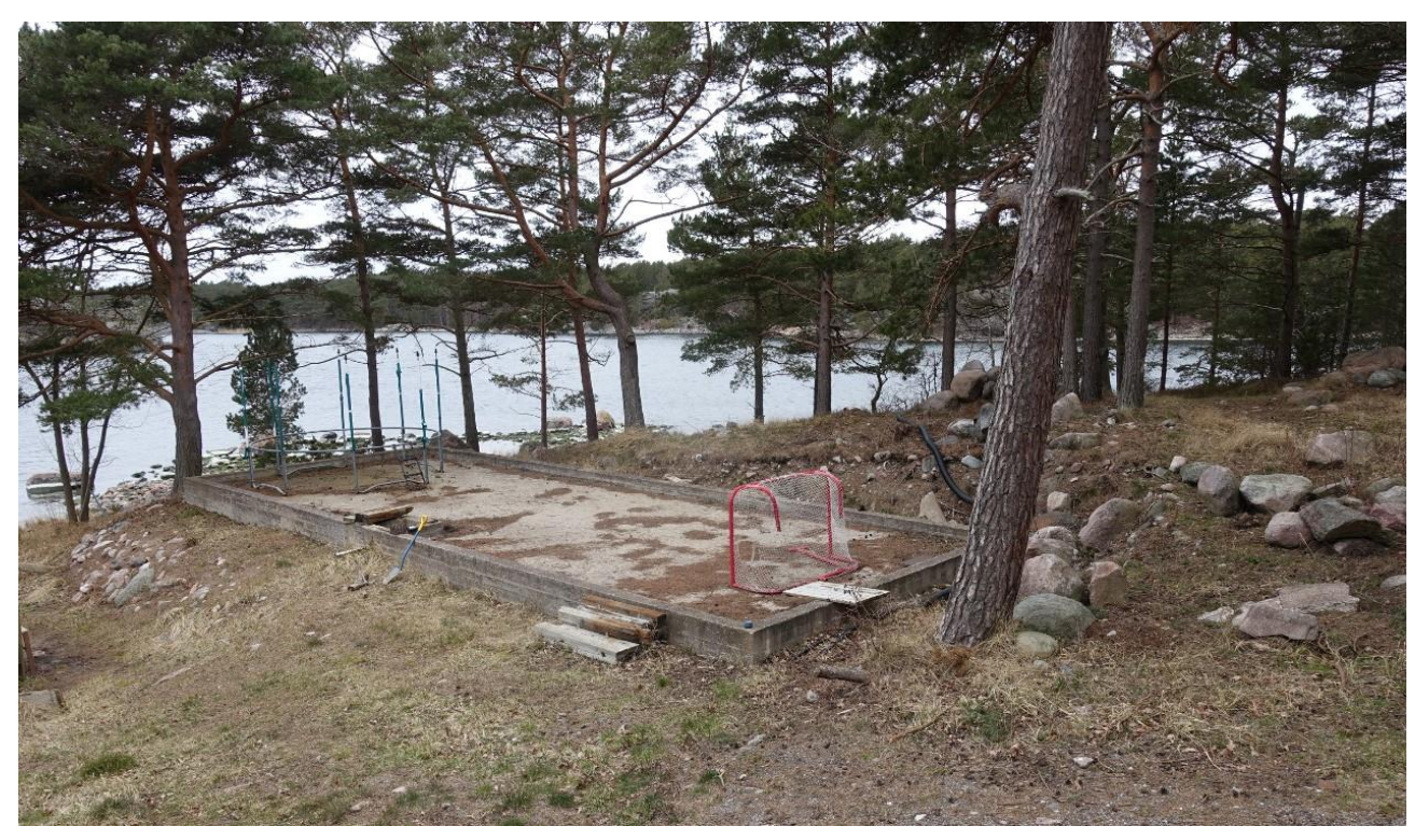
The location of the new service building on Bodö at the onset of the construction work.