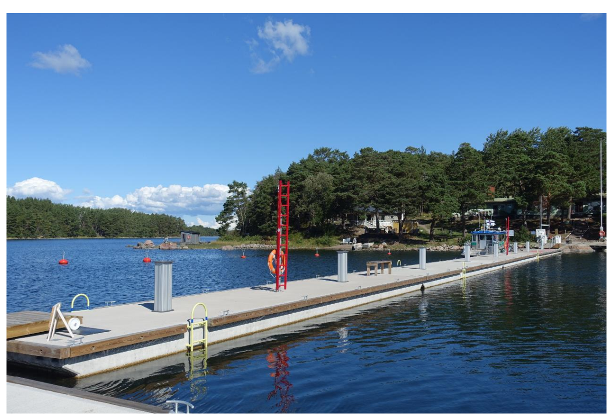
The new jetty on Bodö.