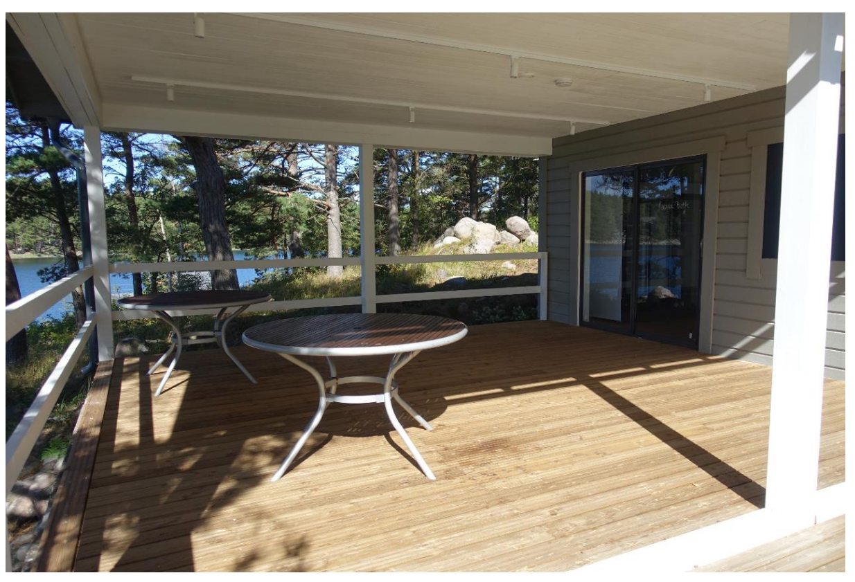
Terrace of the new service building.