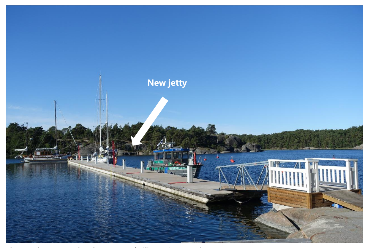
The new jetty on Bodö.