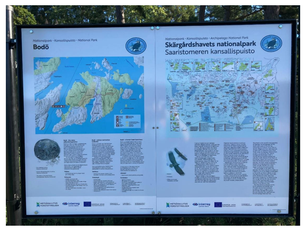
The new information boards on Bodö.