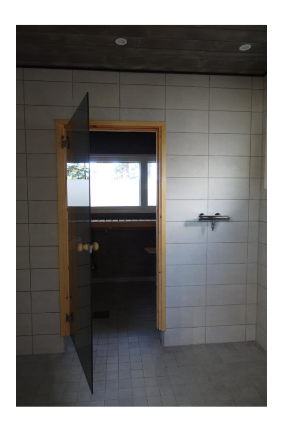
Sauna in the service building.