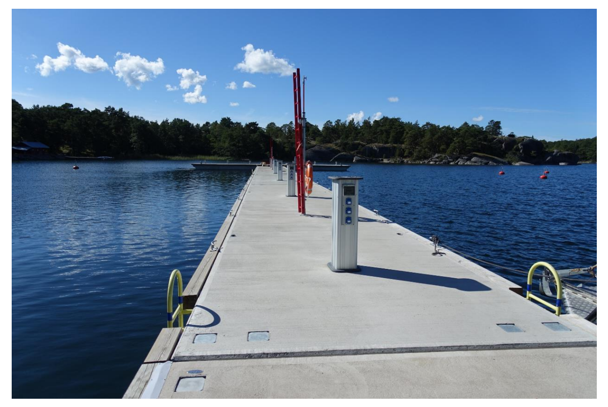
The new jetty on Bodö.