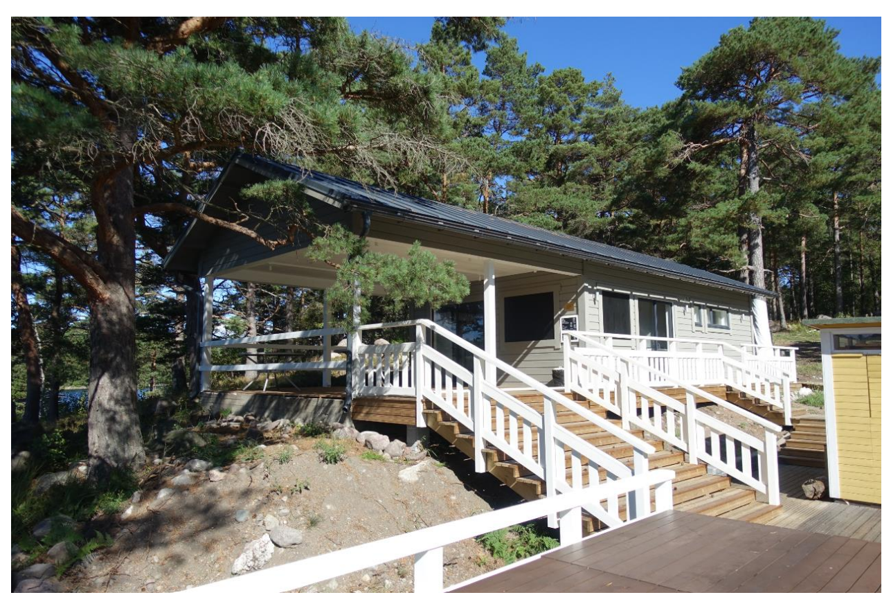
The new service building on Bodö.