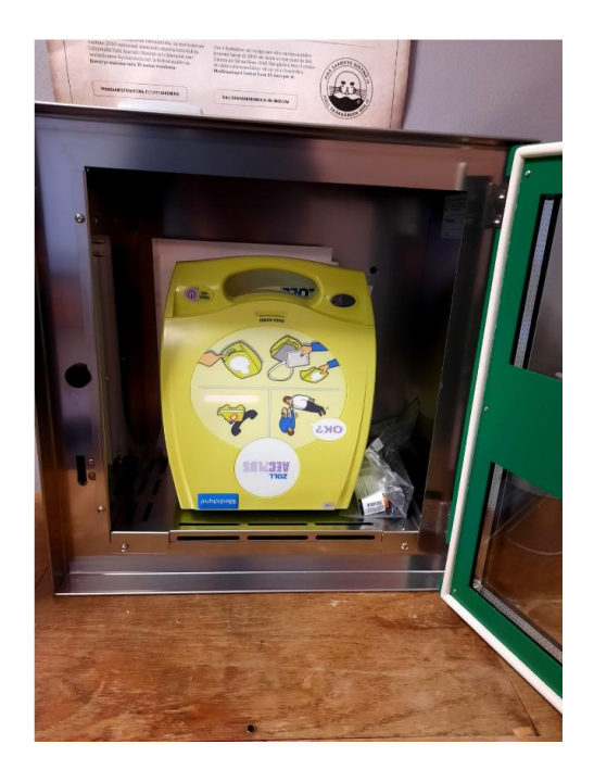
The AED defibrillator unit on Bodö.