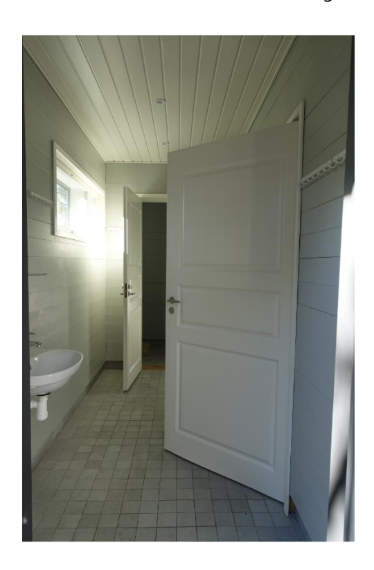
Sauna corridor in the service building.