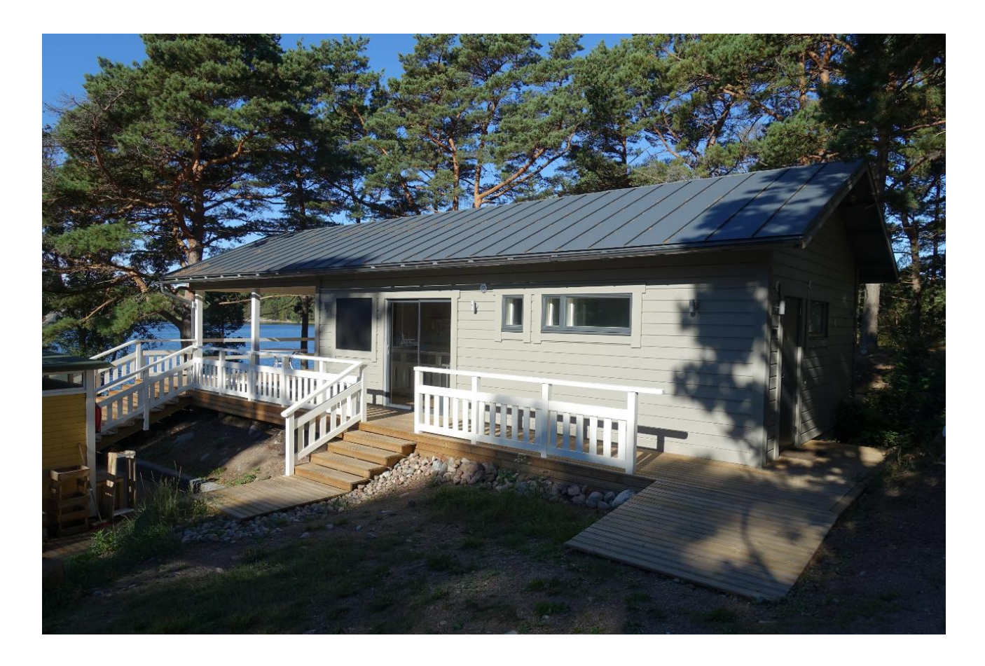
The new service building on Bodö.