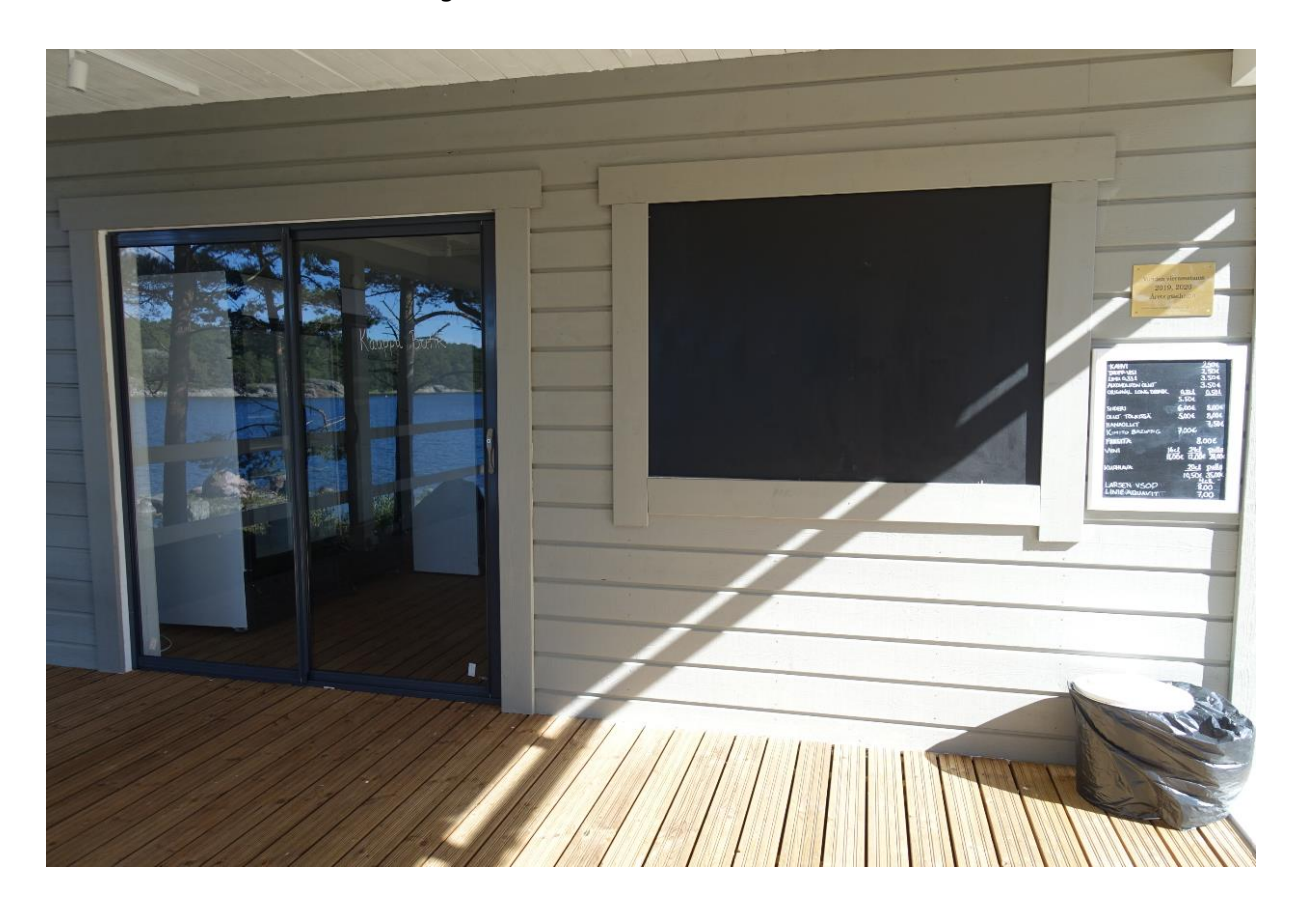
Service hatch and entrance from the terrace to the new service building.