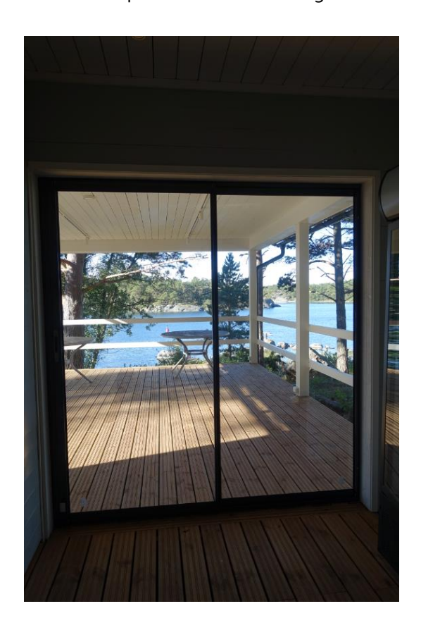
View from the inside of the service building to the terrace.