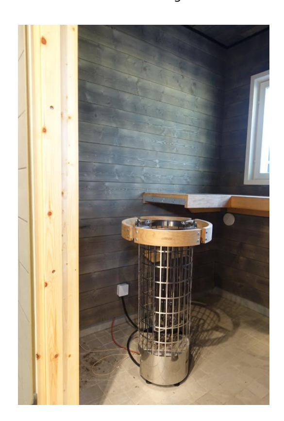
Sauna stove in the sauna of the service building.