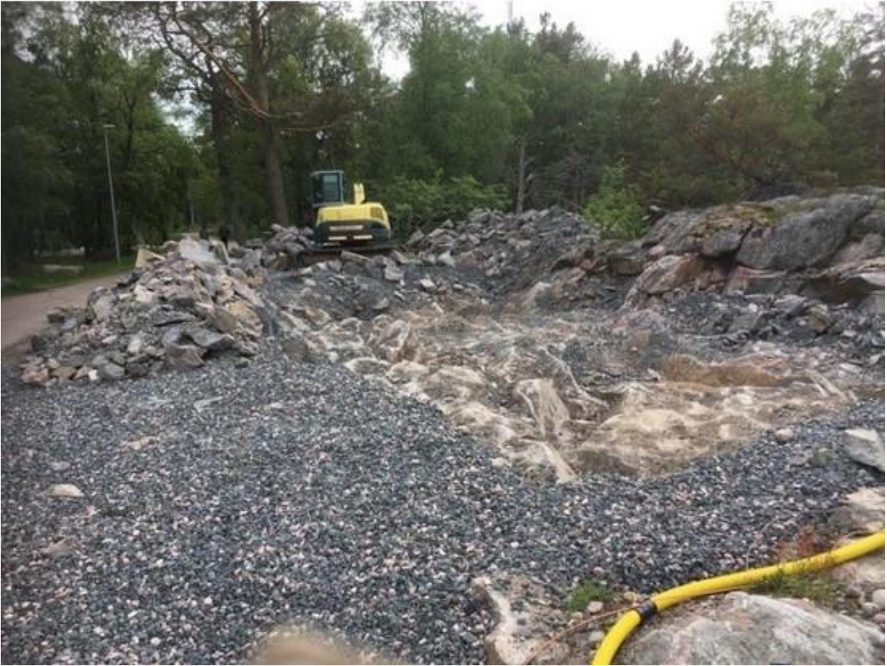
The location of the new harbour reception building on Öro at the onset of construction work.