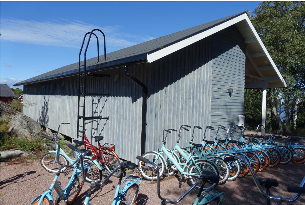
The new harbour reception building on Öro.