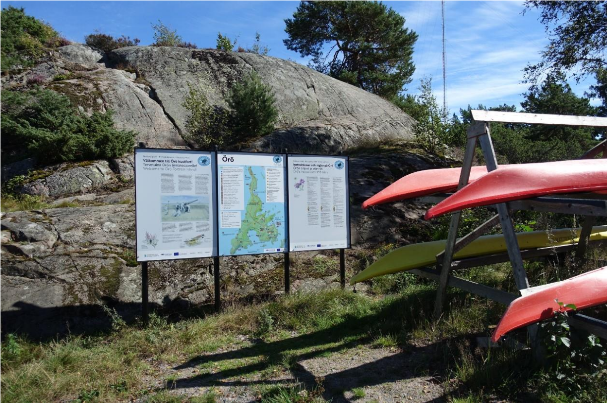
The updated information boards on Öro.