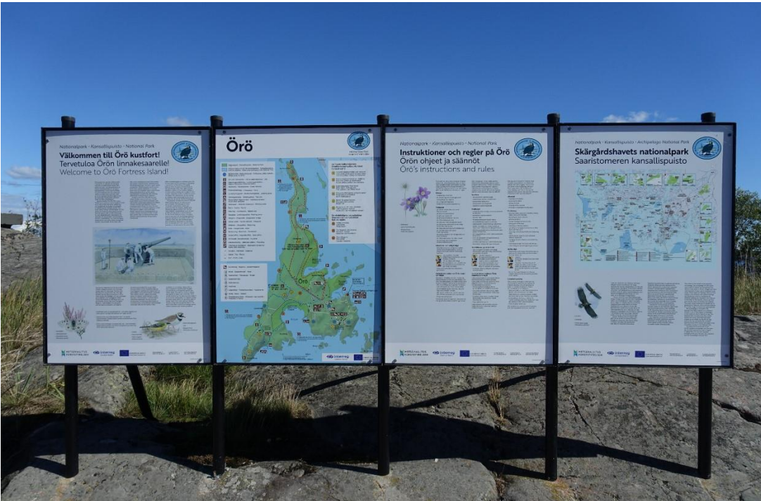
The updated information boards on Öro.