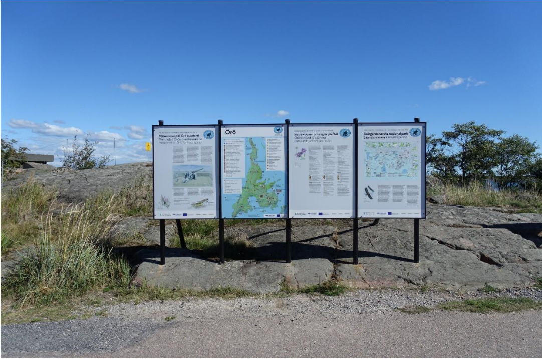
The updated information boards on Öro.

The content of the information boards was updated. New information boards were procured, and the updated information boards were installed on Öro.