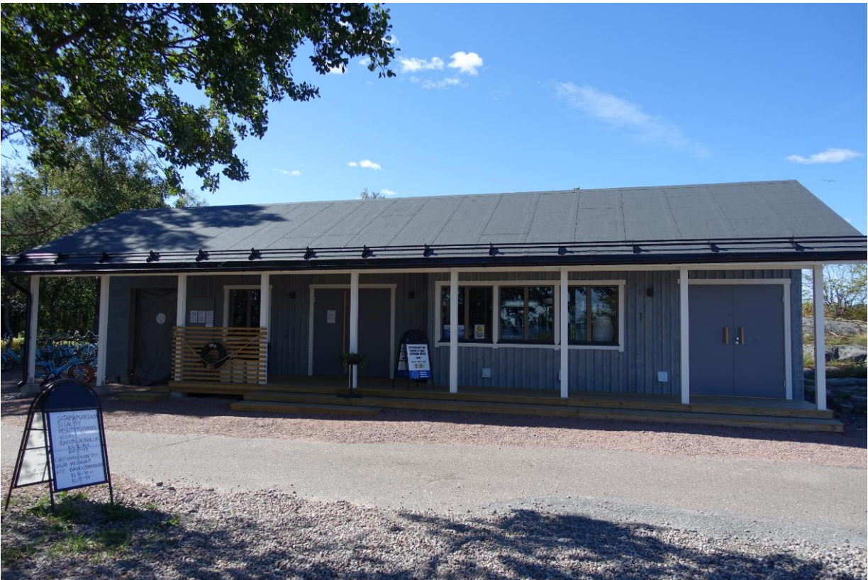
The new harbour reception building on Öro.