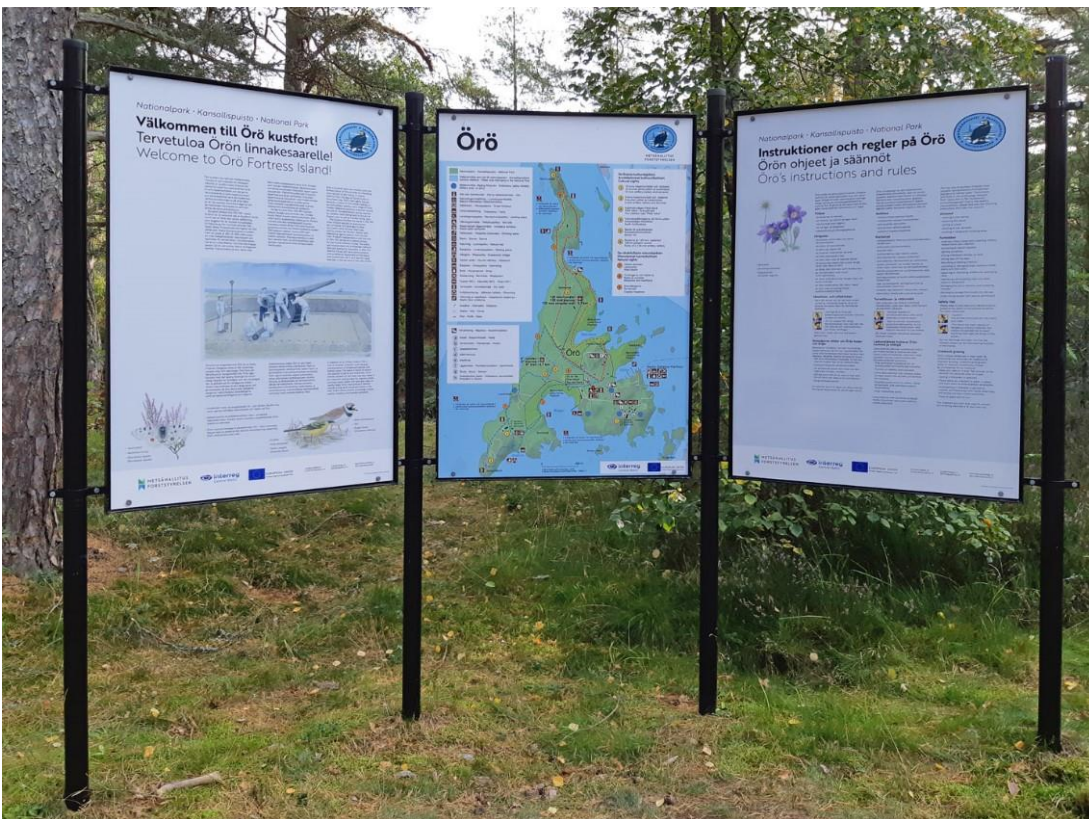
The updated information boards on Örö.