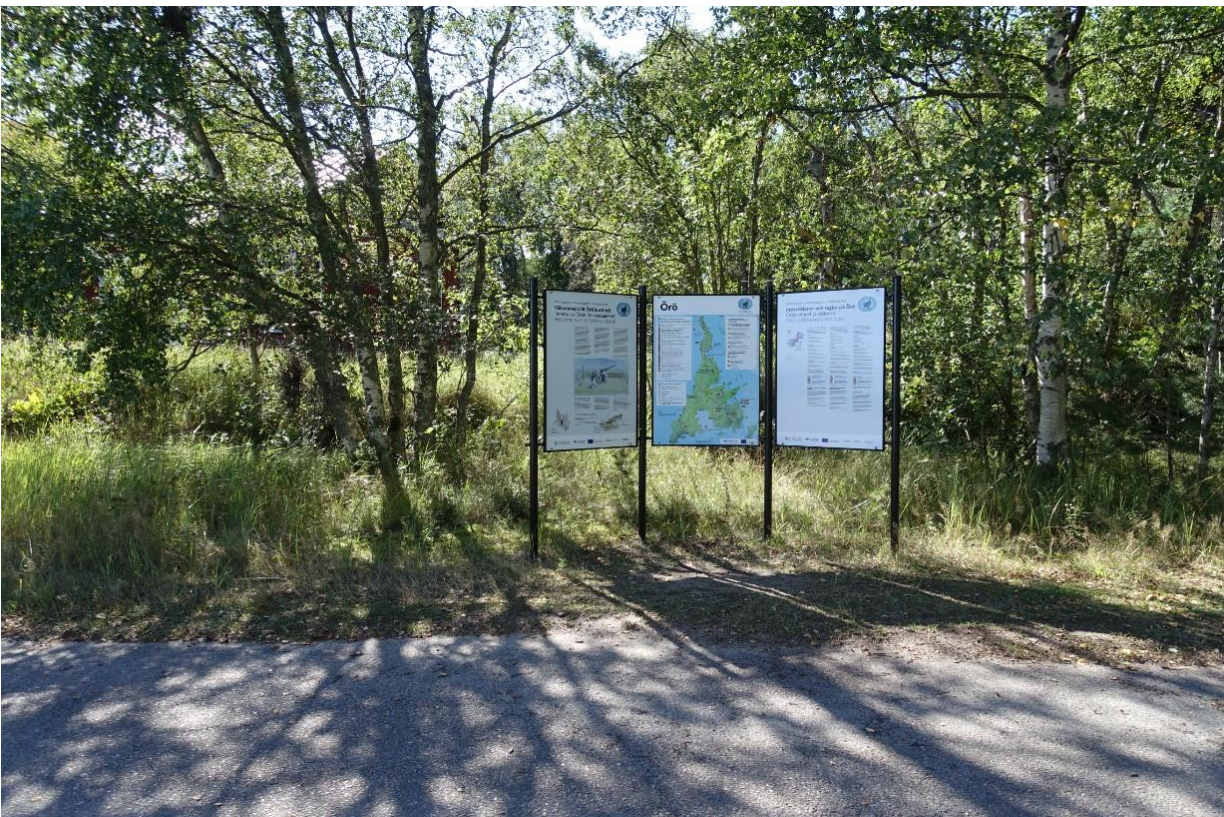
The updated information boards on Öro.