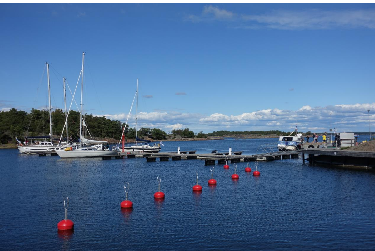
Ten new buoys were installed in Örö harbour.