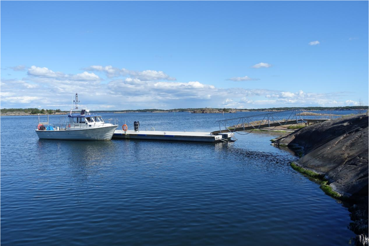
The new jetty for big boats on Öro.