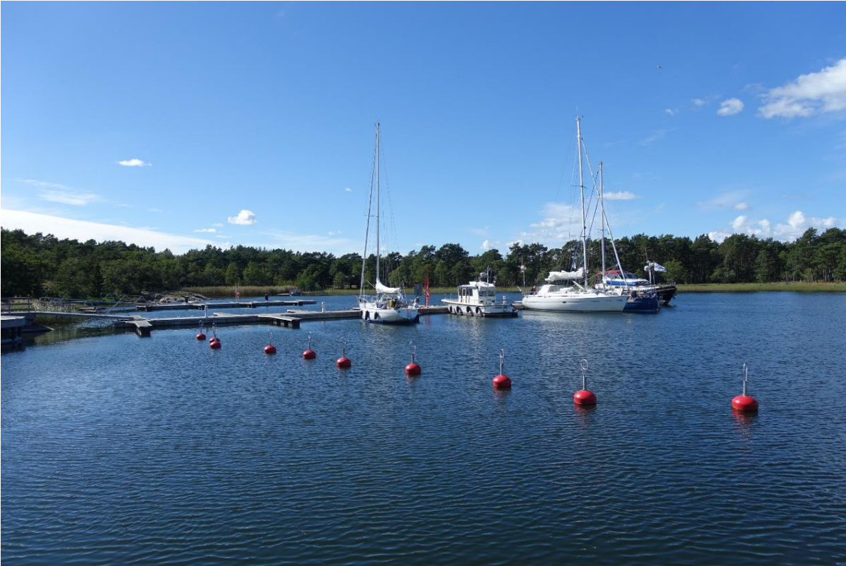
Ten new buoys were installed in Örö harbour.