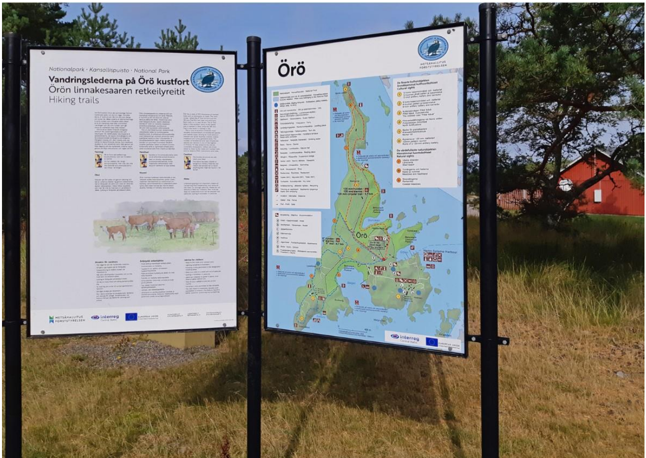
The updated information boards on Öro.