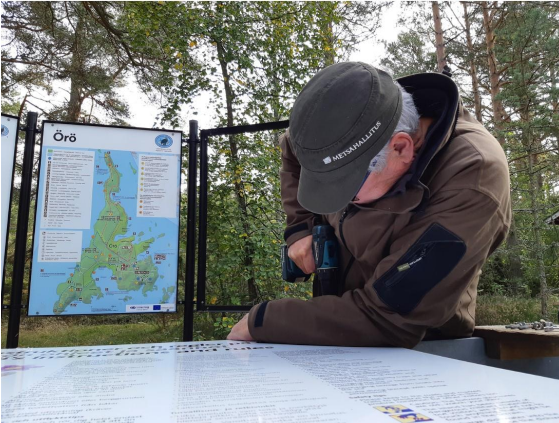
The updated information boards on Örö.