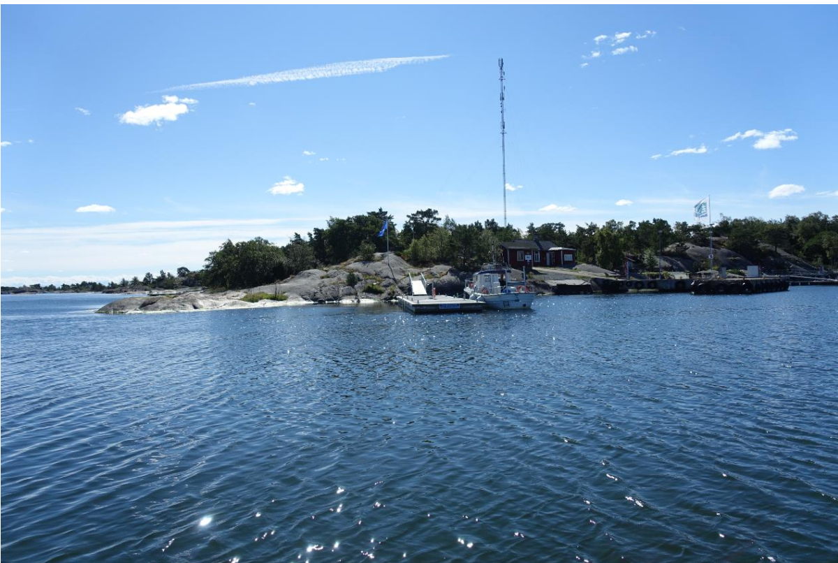
The new jetty for big boats on Öro.