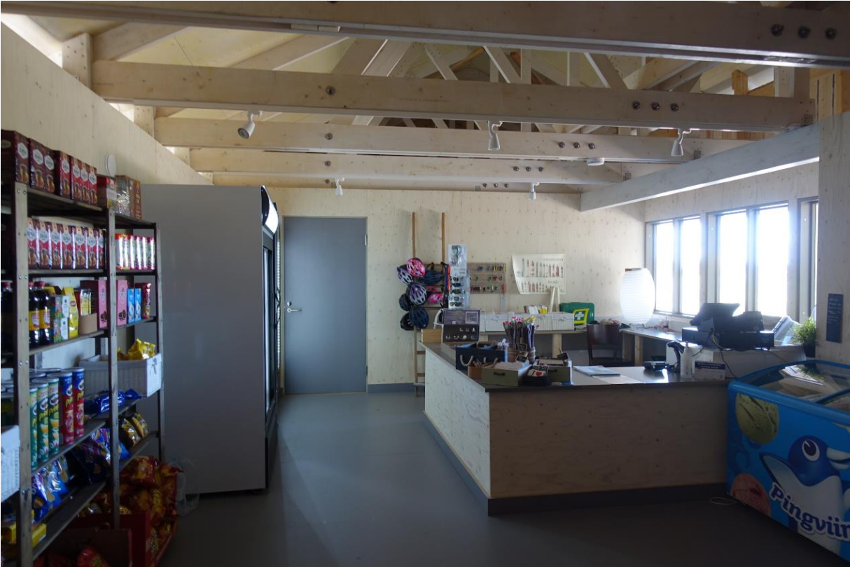
The interior of the harbour reception building.