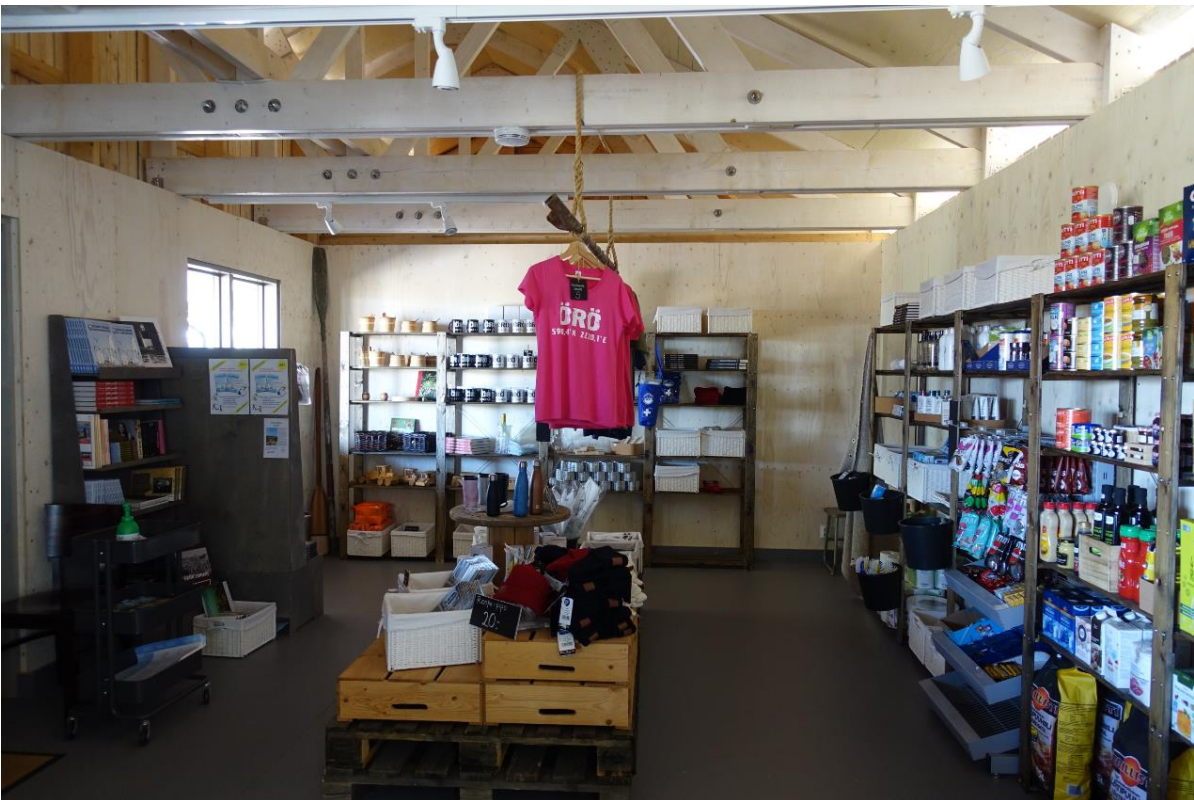
The interior of the harbour reception building.