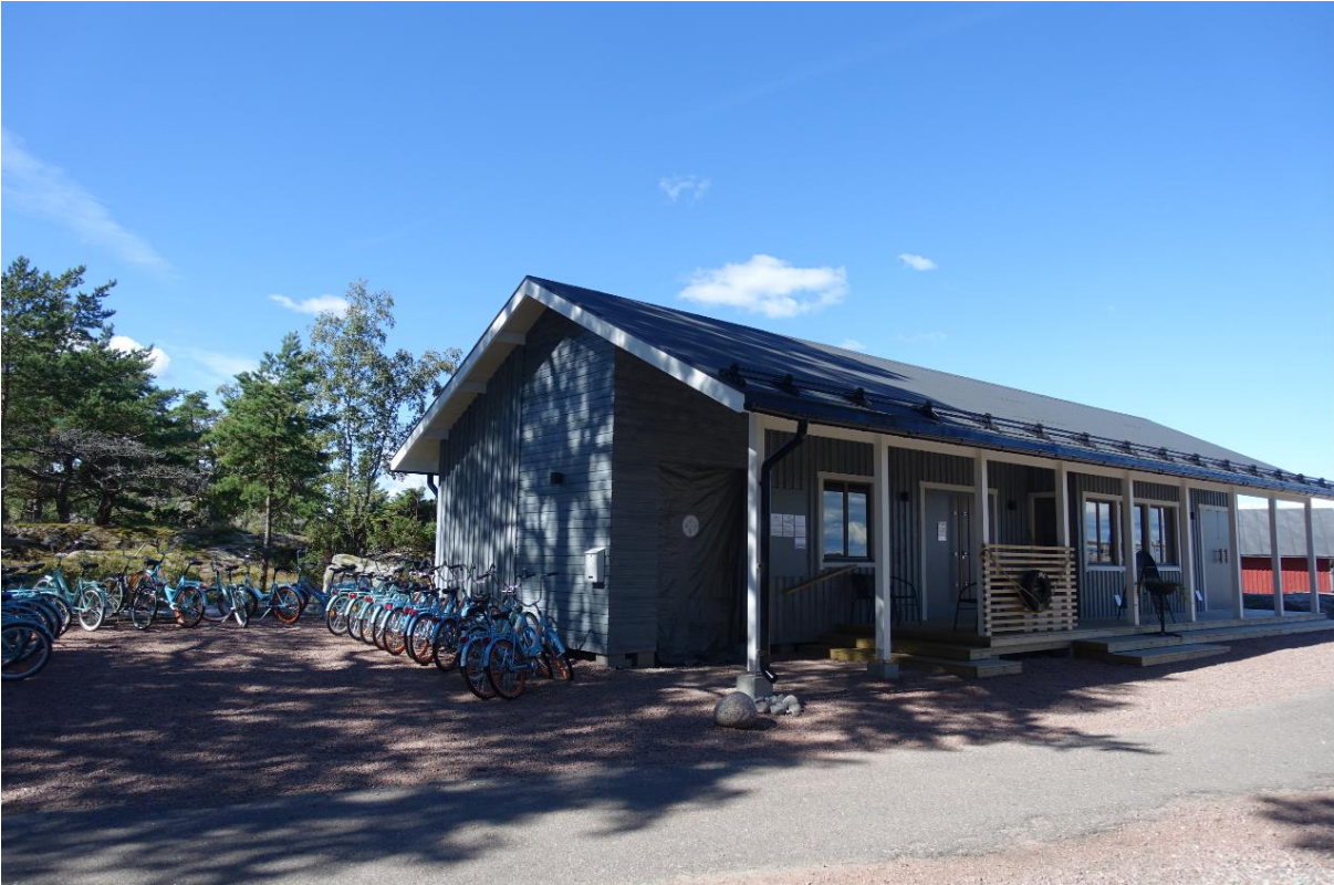
The new harbour reception building on Öro.