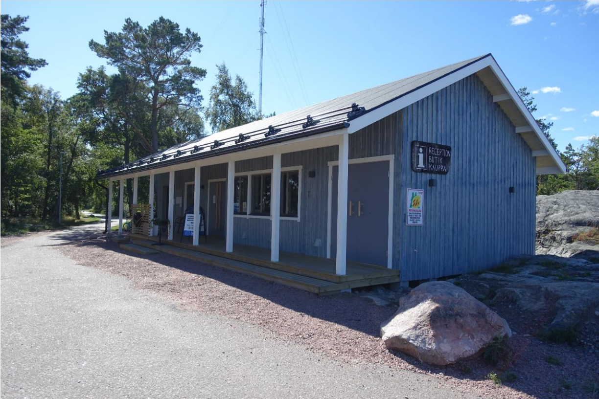
The new harbour reception building on Öro.