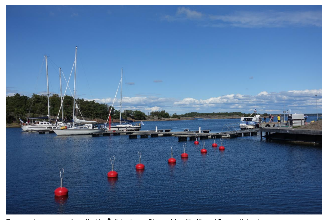
Ten new buoys were installed in Örö harbour.