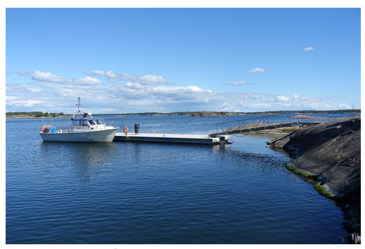
The new jetty for big boats on Örö.