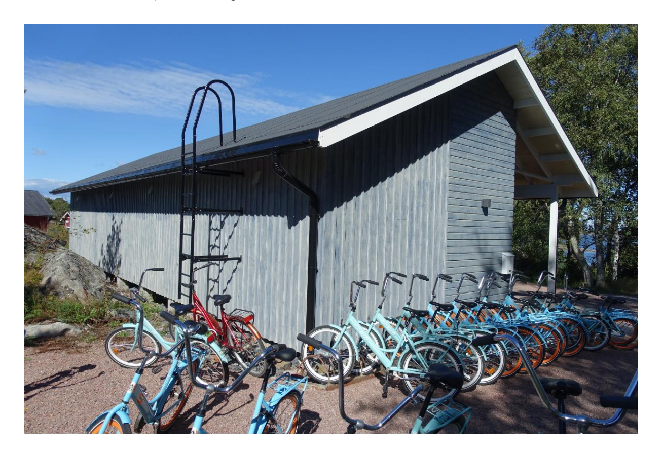
The new harbour reception building on Örö.