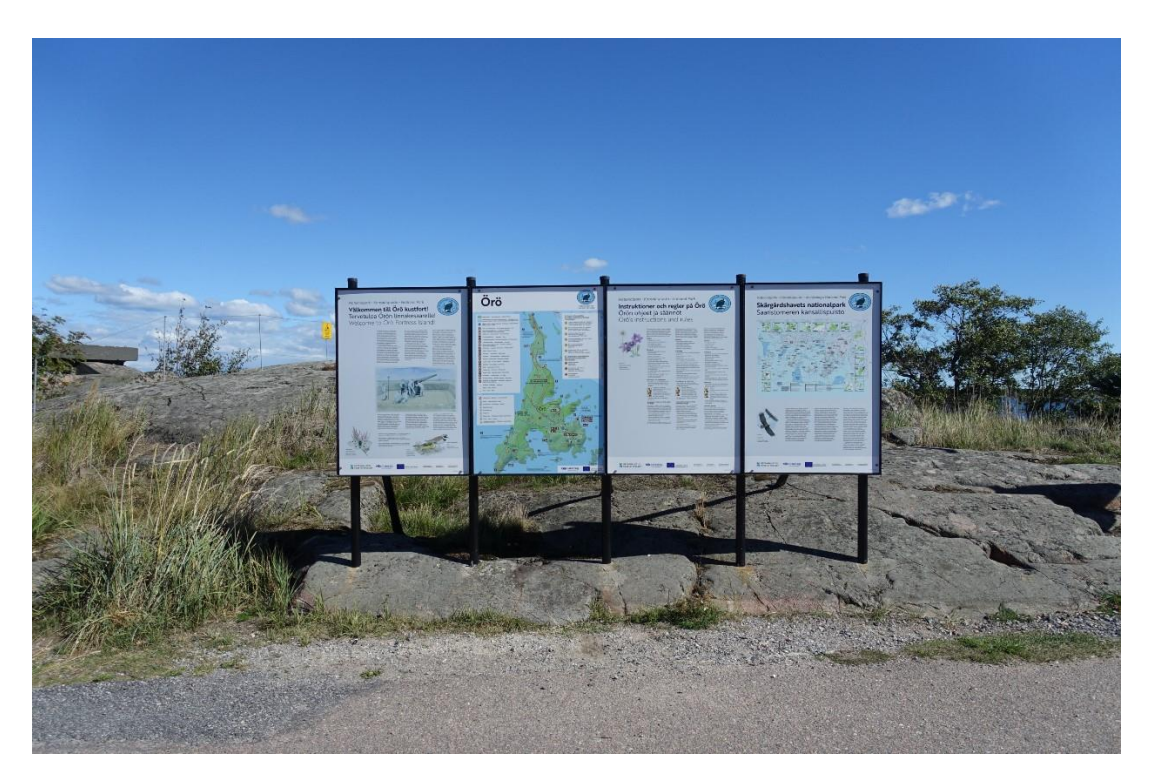
The updated information boards on Örö.

The content of the information boards was updated. New information boards were procured, and the updated information boards were installed on Örö.