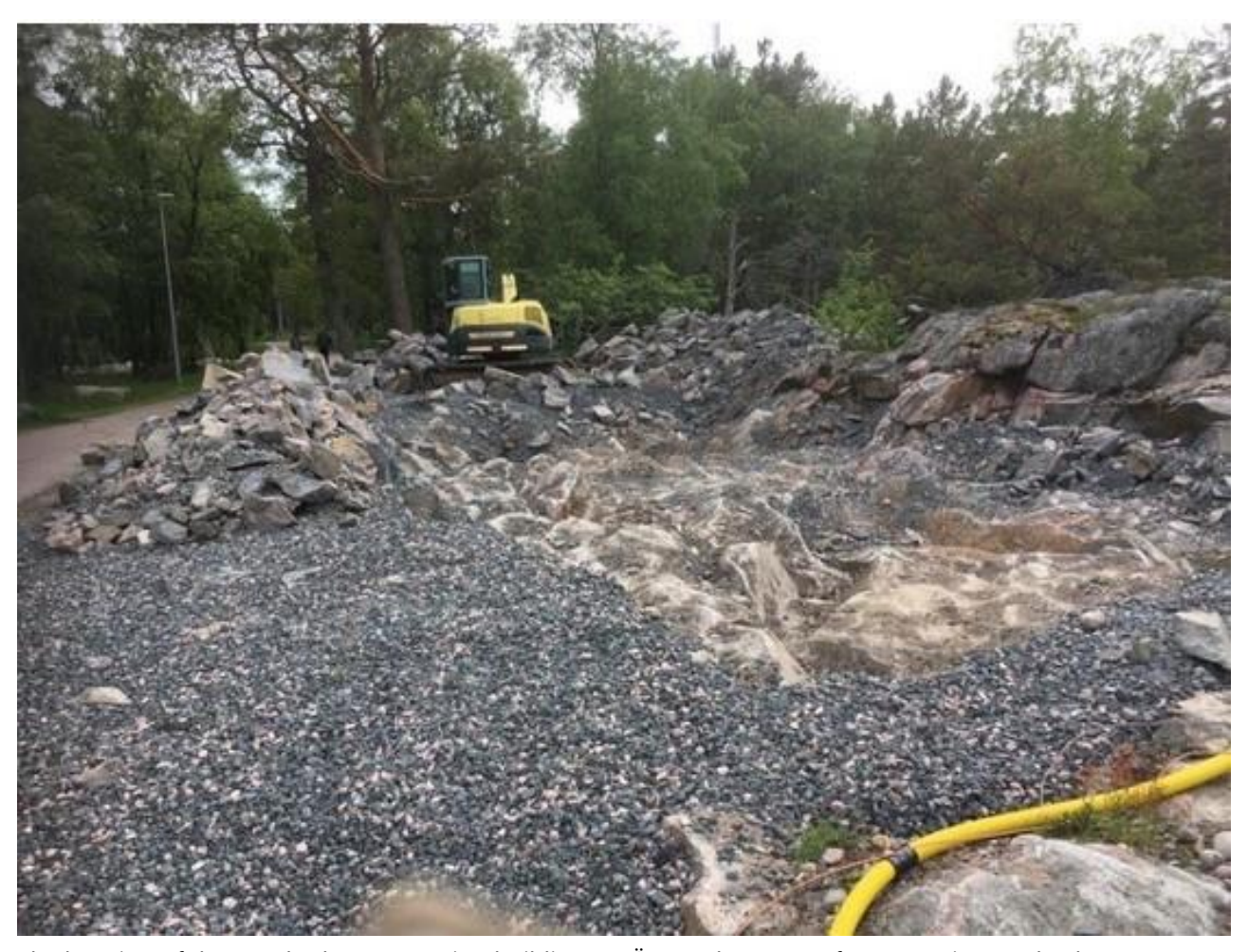
The location of the new harbour reception building on Örö at the onset of construction work.