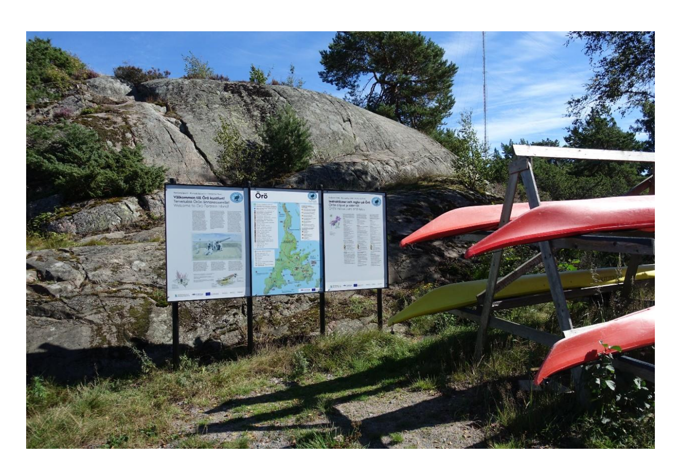
The updated information boards on Örö.