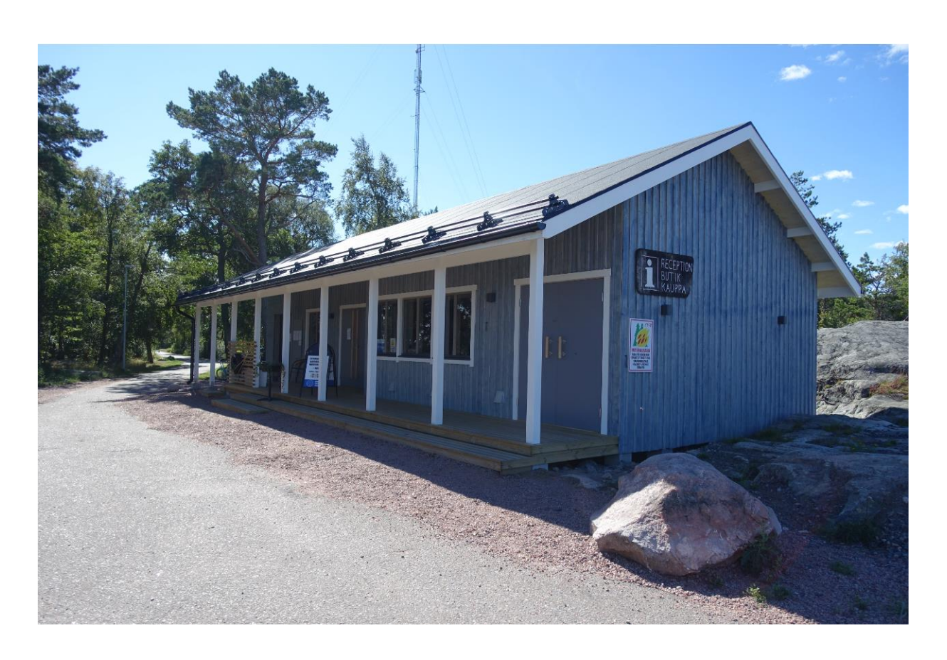
The new harbour reception building on Örö.