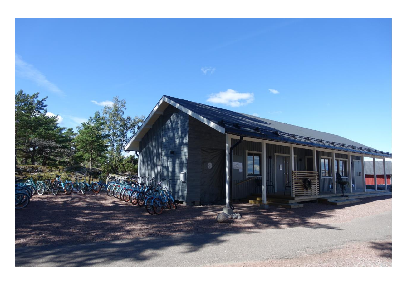
The new harbour reception building on Örö.