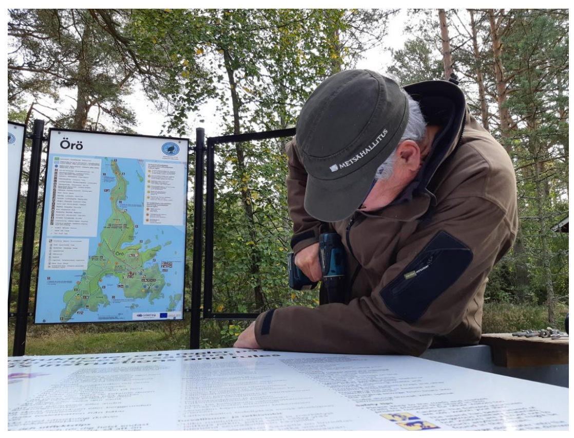
The updated information boards on Örö.