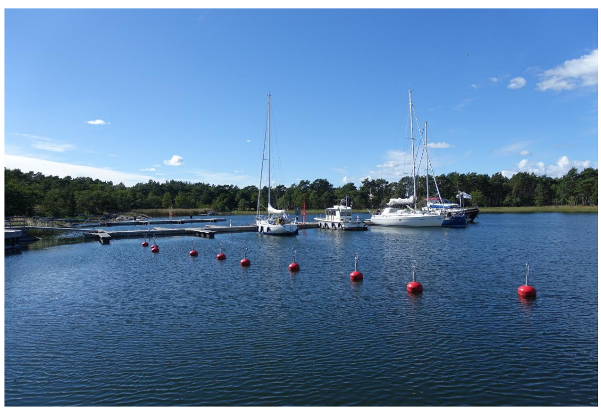
Ten new buoys were installed in Örö harbour.