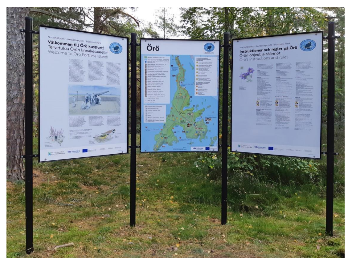
The updated information boards on Örö.