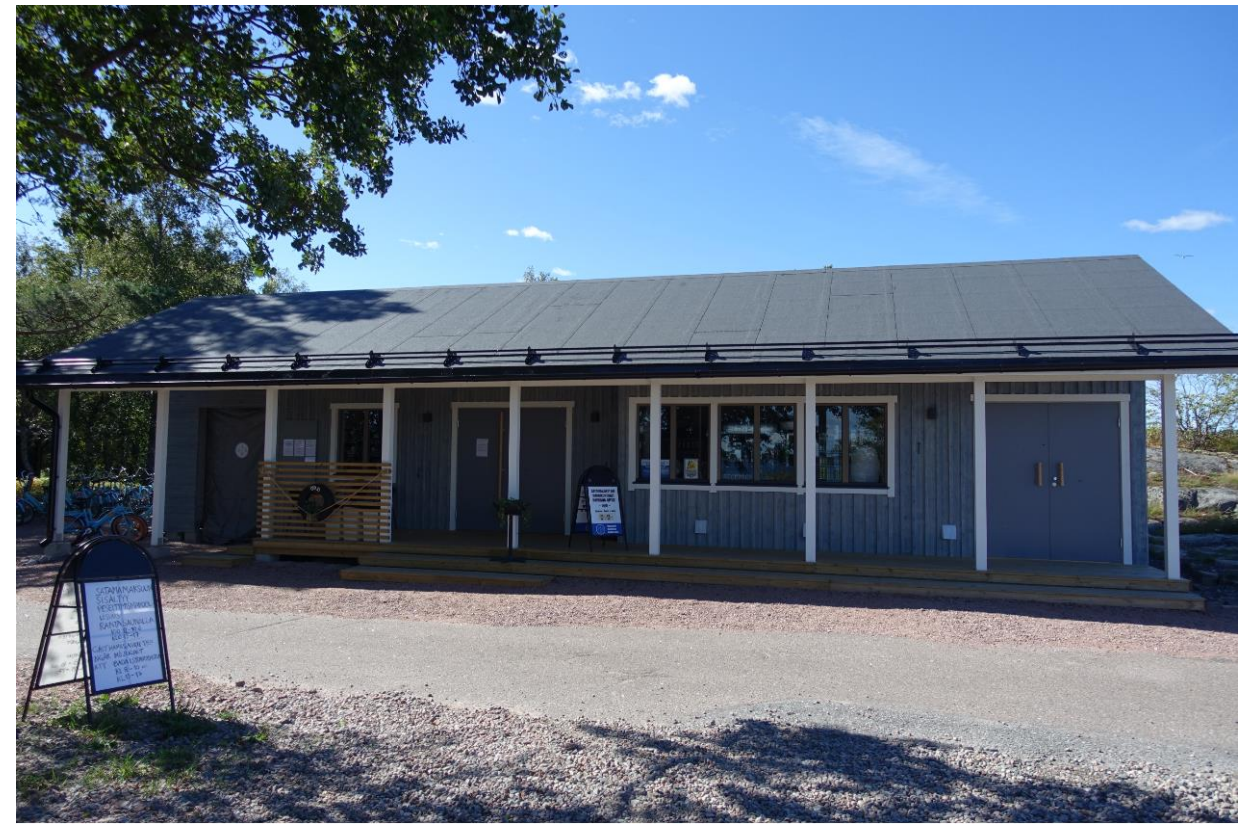
The new harbour reception building on Örö.