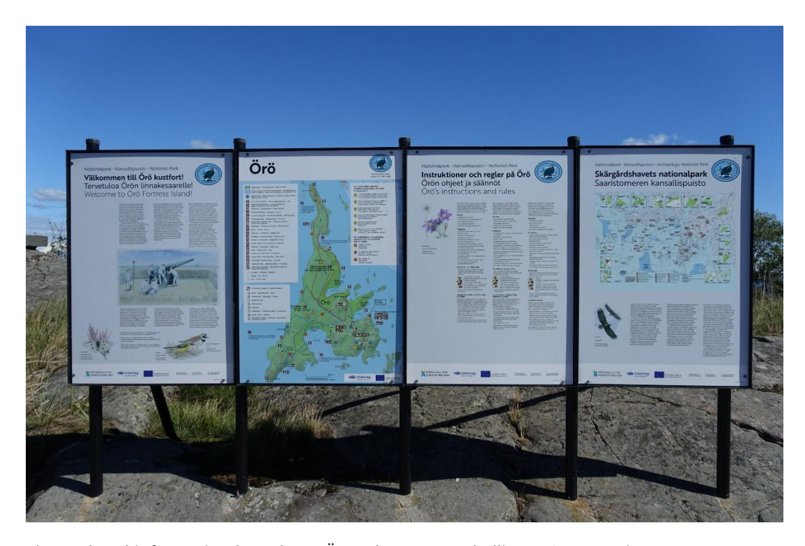
The updated information boards on Örö.