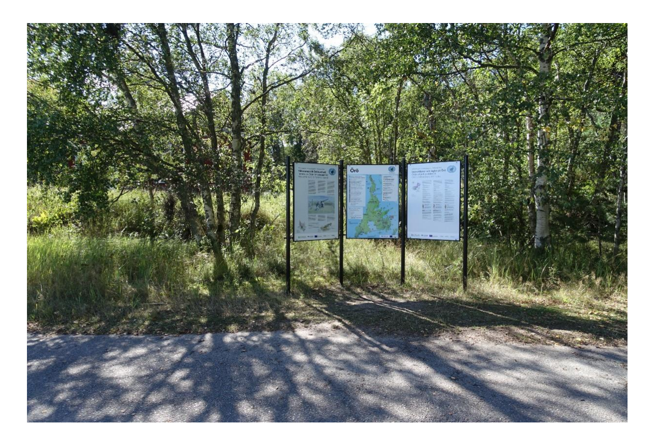
The updated information boards on Örö.