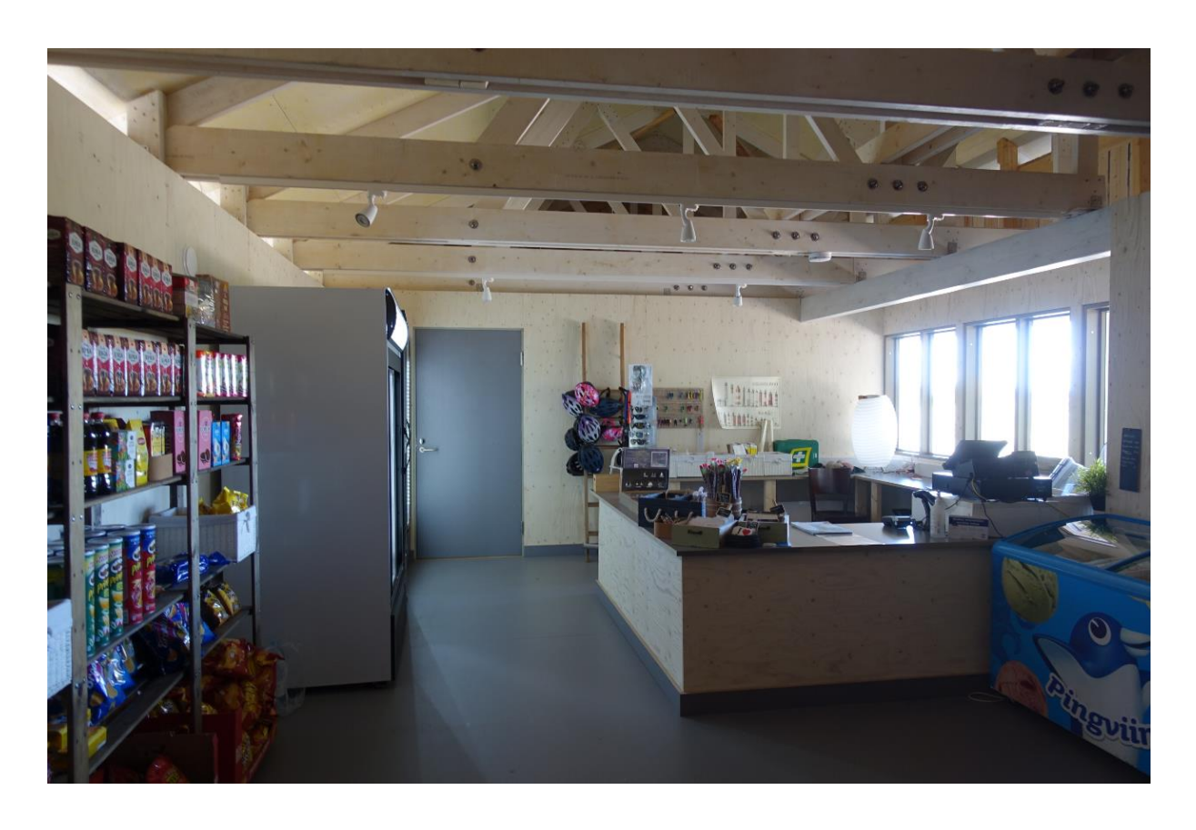
The interior of the harbour reception building.