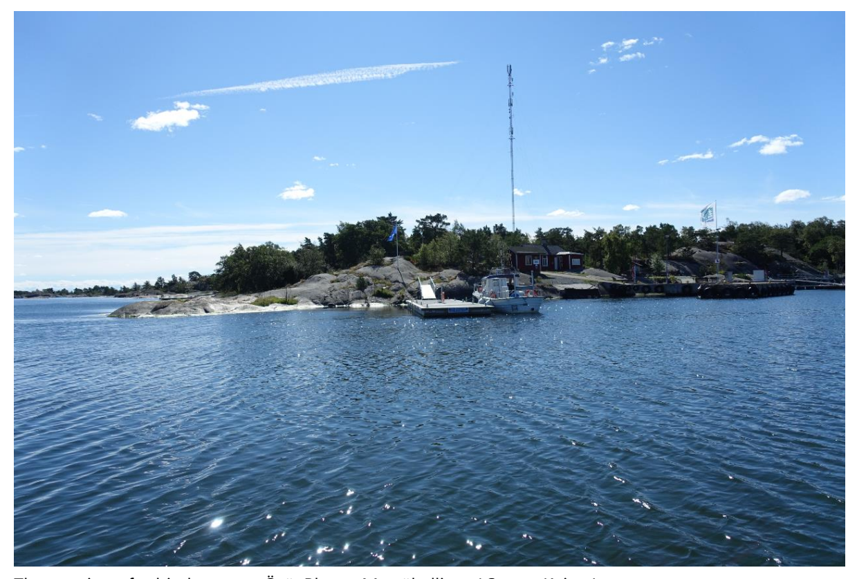
The new jetty for big boats on Örö.