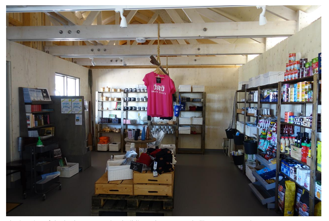
The interior of the harbour reception building.