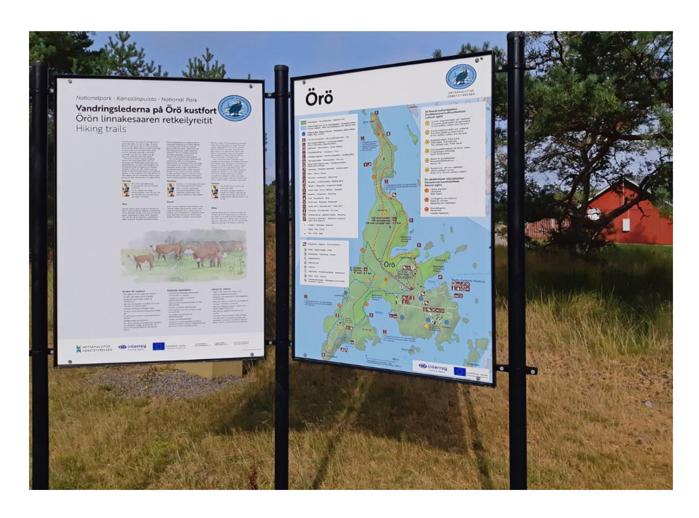
The updated information boards on Örö.