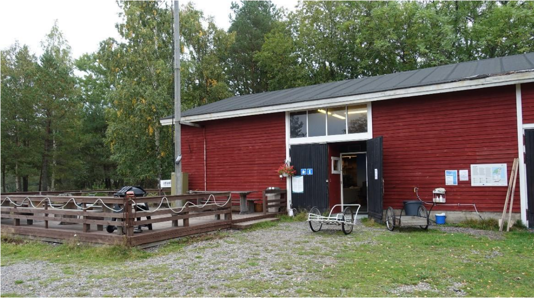
The updated information boards on Jussarö.