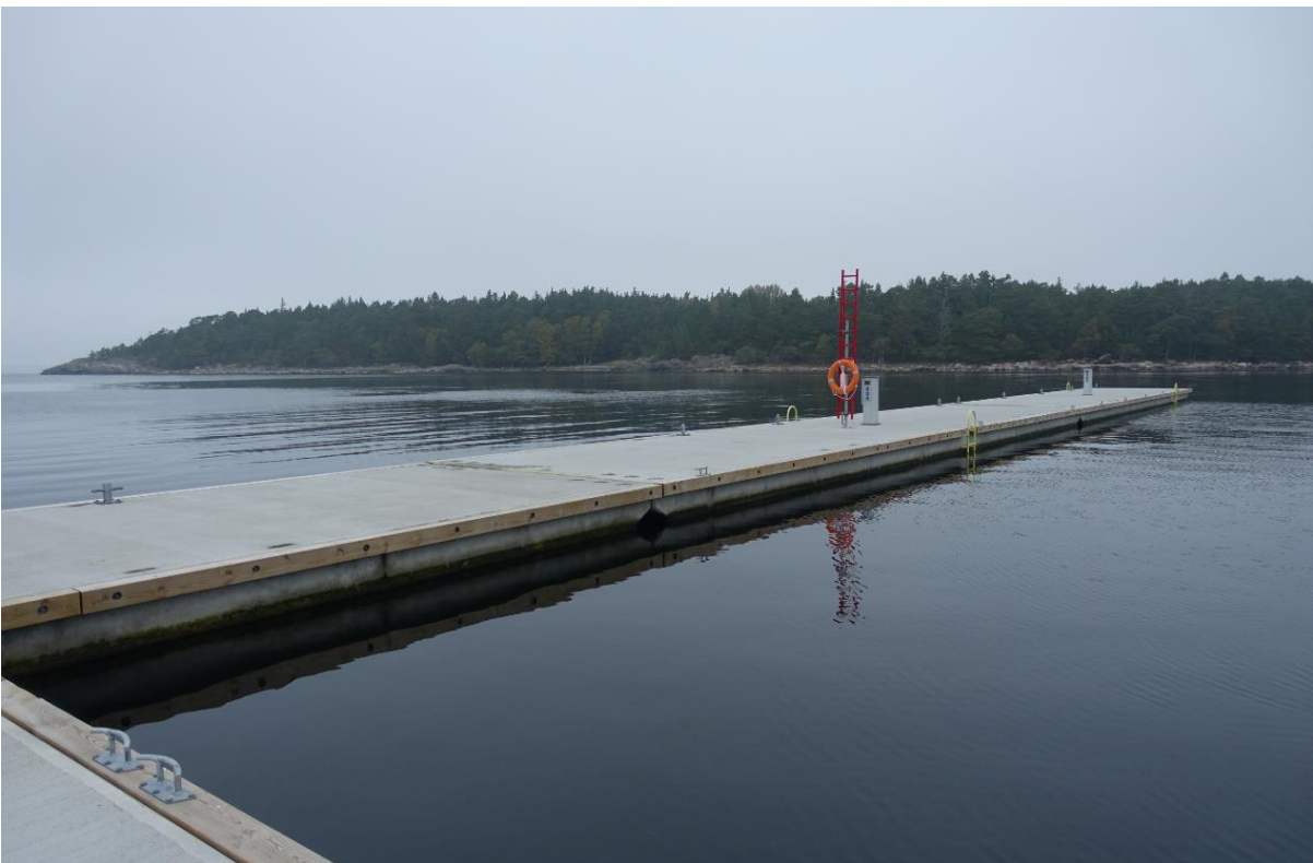
The new jetty on Jussarö.