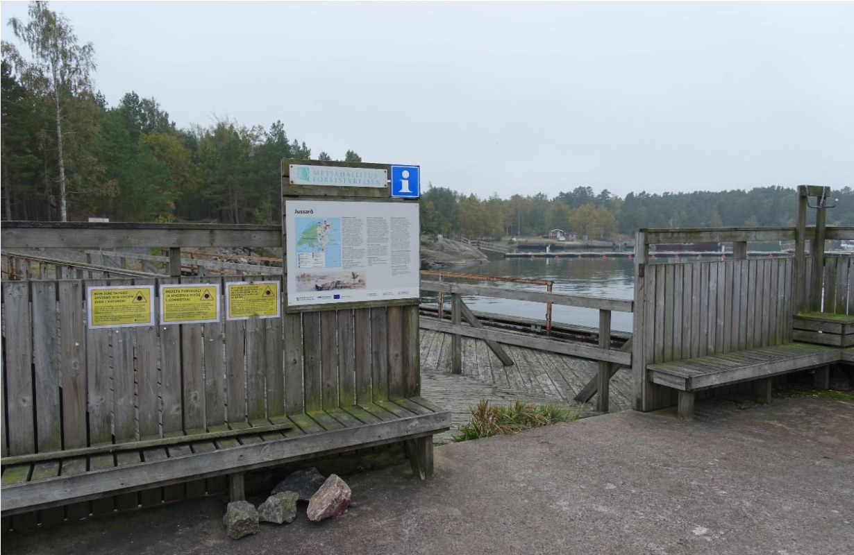
The updated information boards on Jussarö.