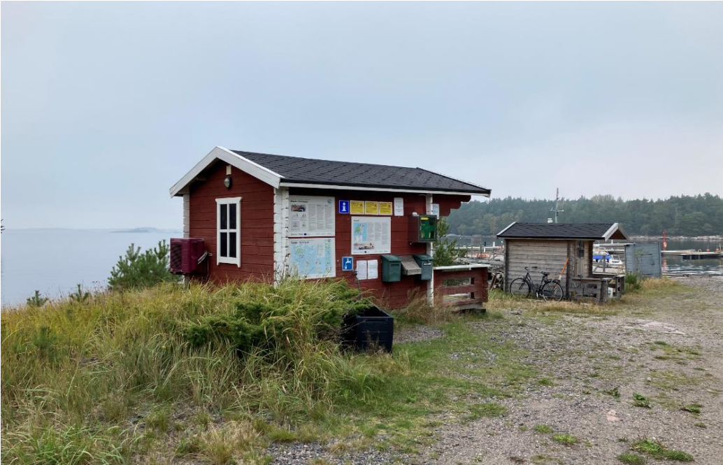
The updated information boards on Jussarö.

The content of the information boards was updated. New information boards were procured, and the updated information boards were installed on Jussarö.