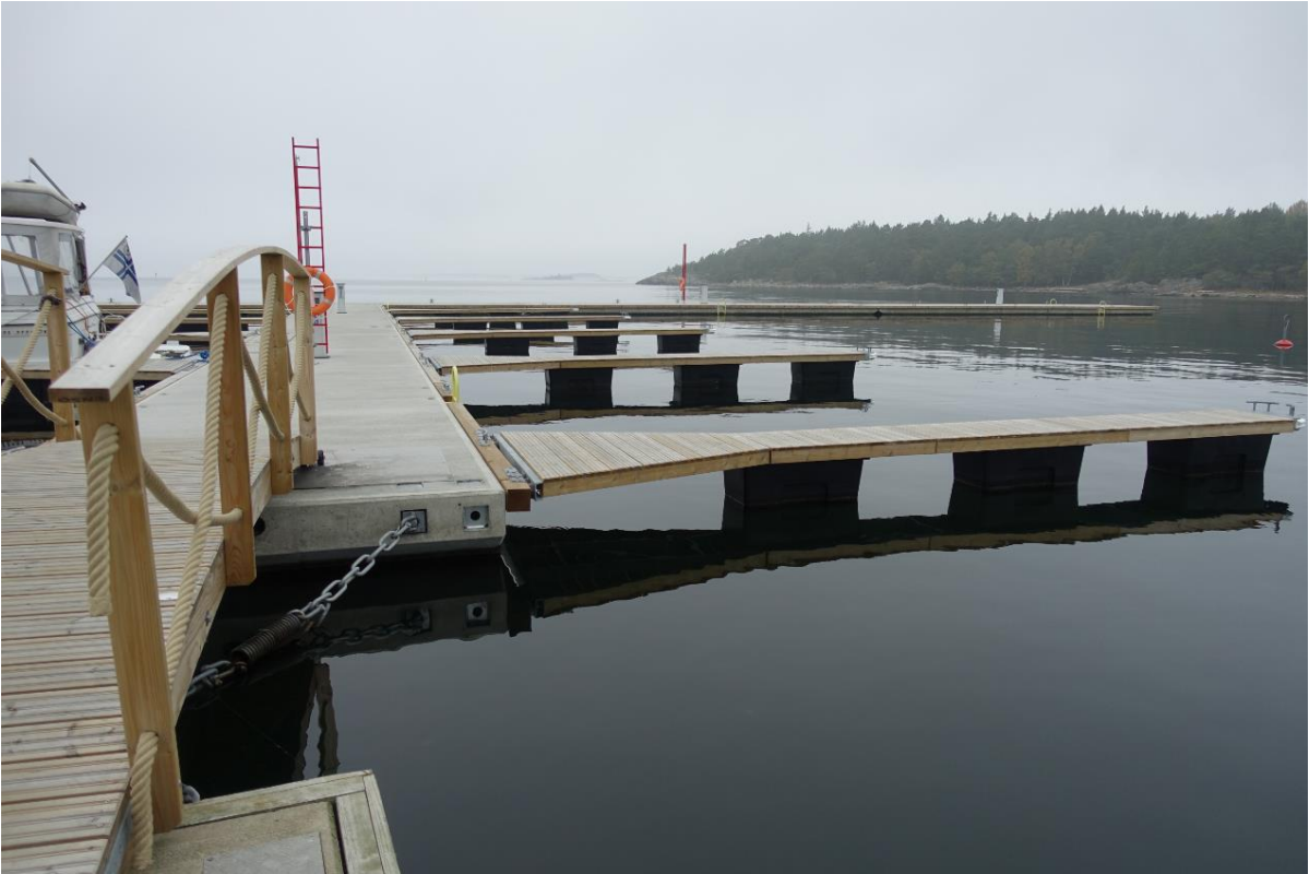
The new jetty on Jussarö.