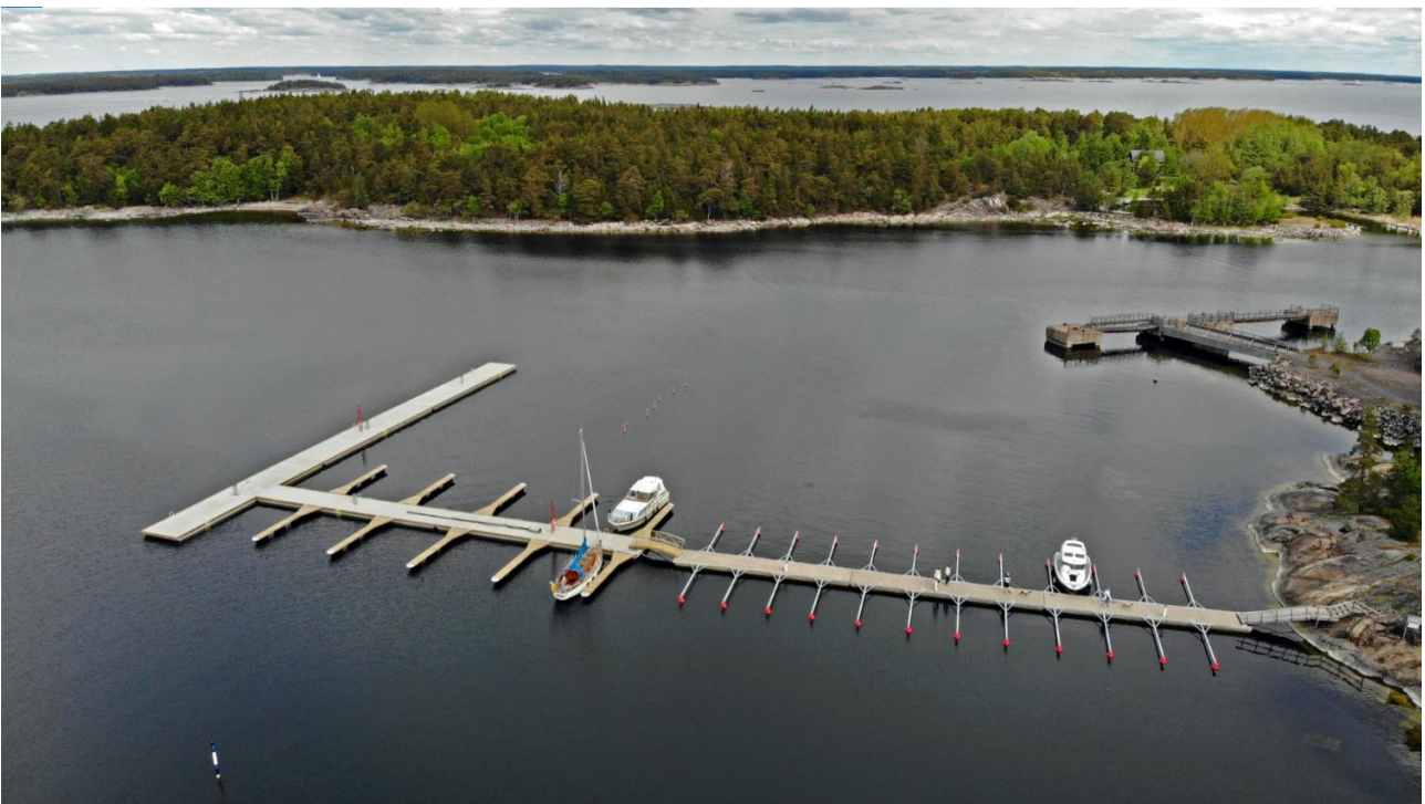
The new jetty on Jussarö.