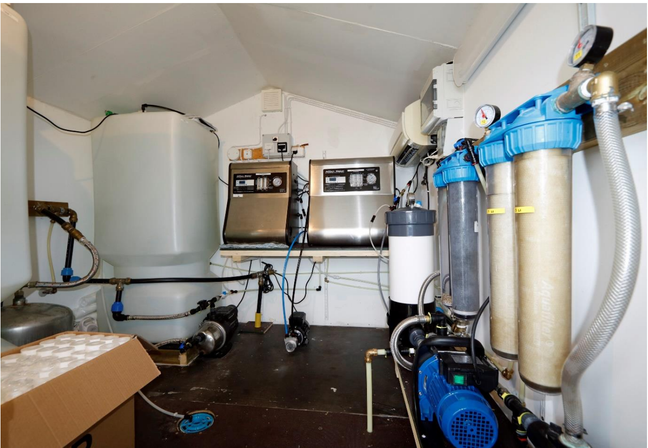
The reverse osmosis machines on Jussarö.

The procurement of the new reverse osmosis machine took place between March 2019 and April 2019. The installation of the new reverse osmosis machine was completed in time for the 2019 season. The building housing the old RO machine was adapted so that both the new and the old RO machines could be housed in the same building. The old RO machine was serviced in order to work as a back-up system.