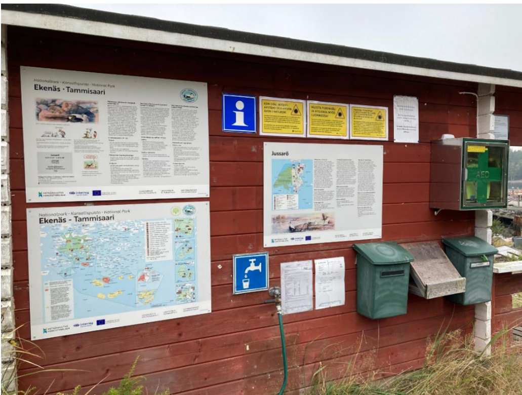
The updated information boards on Jussarö.