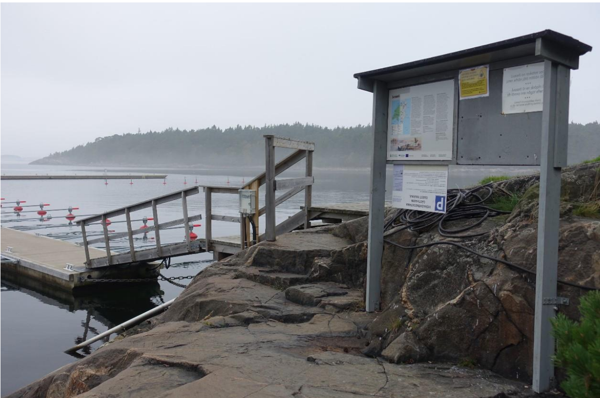
The updated information boards on Jussarö.