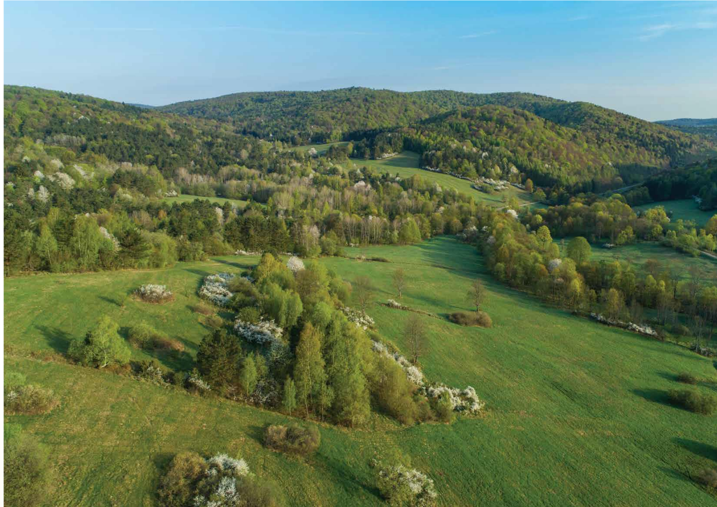
Protected Areas – Cornerstones of Ecological Connectivity in the Carpathians and Beyond International Conference, Visegrád, Hungary, 28-30 September 2021 - Project co-funded by European Union Funds (ERDF, IPA)