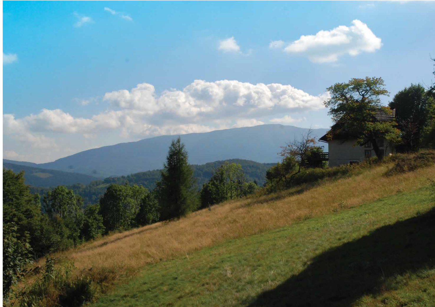
Protected Areas – Cornerstones of Ecological Connectivity in the Carpathians and Beyond International Conference, Visegrád, Hungary, 28-30 September 2021 - Project co-funded by European Union Funds (ERDF, IPA)