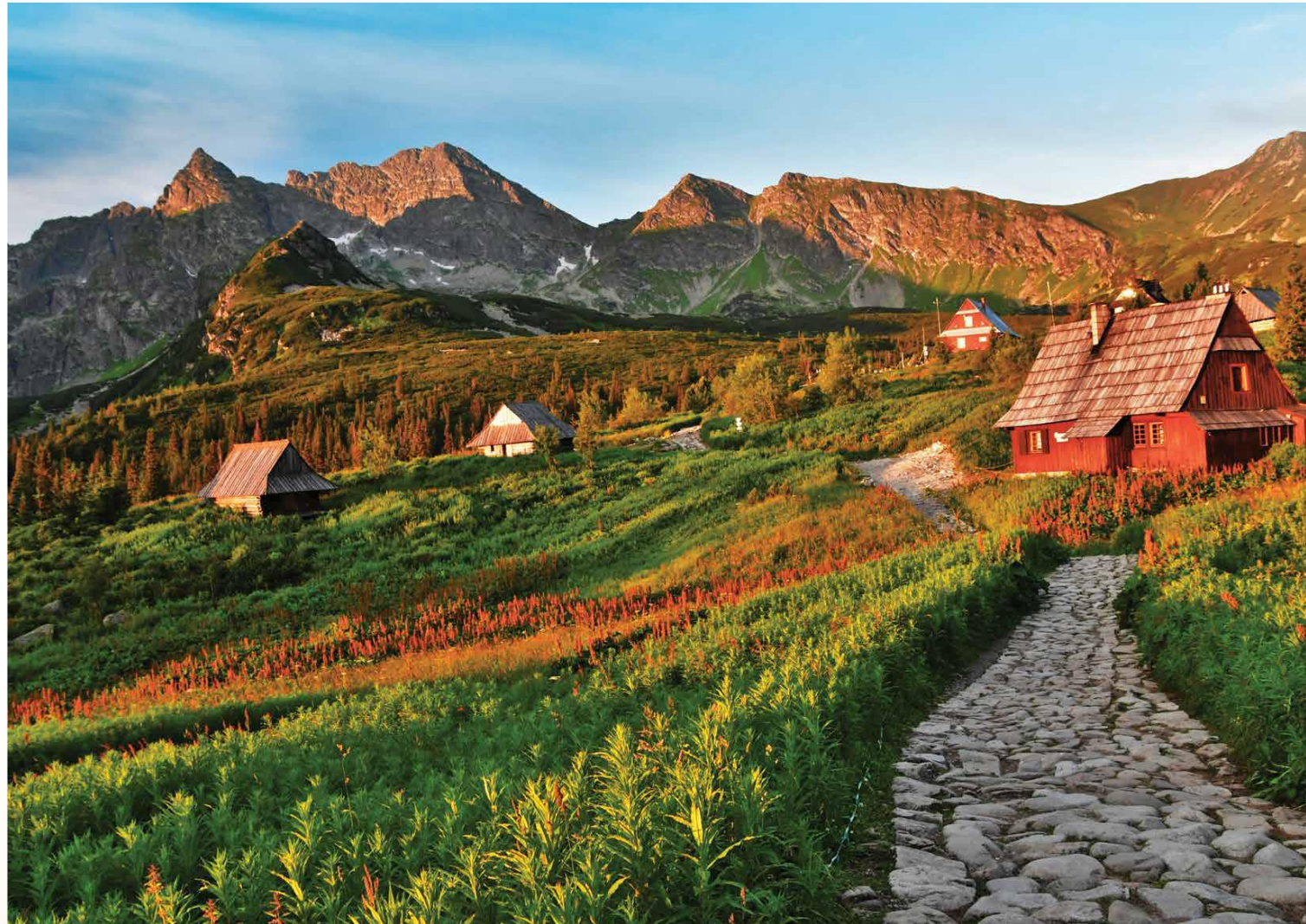
Protected Areas – Cornerstones of Ecological Connectivity in the Carpathians and Beyond