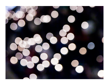
LIGHT + BUILDING

Further information and registration at: http://www.ikem.de/ikem-jahrestagung-2018/