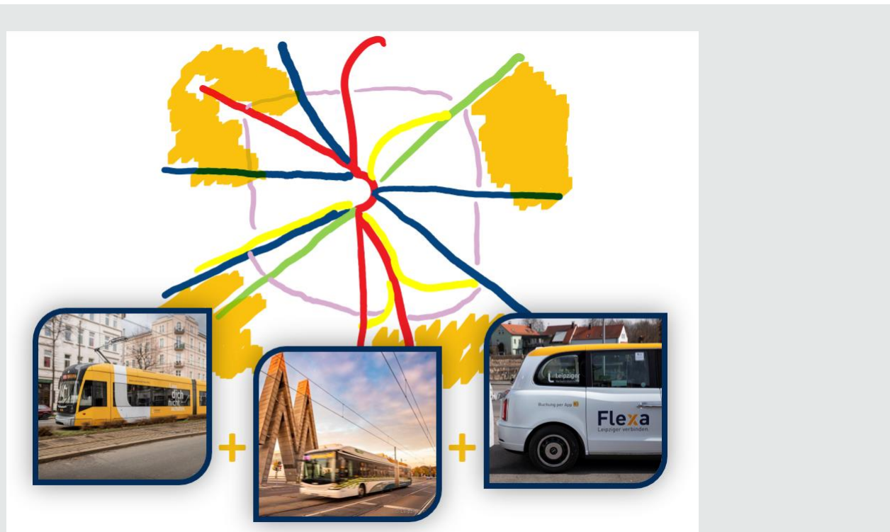
Figure 2: Initial abstract vision of the role of LVBs DRT product Flexa among Tram and bus lines. DRT should complement/replace line based services at the periphery, where the structure of settlement and road network disqualifies line based services.

To substantiate this vision, the goal of Dynaxibility4CE was to project and prepare a new set of pilot areas that will (partially) replace existing bus service. All requirements for this goal should be identified along the way, clarified and potentially resolved. These pilots will be launched in late 2022. Hence, the action plan is a work in progress. A number of requirements could be completely resolved, some are in implementation prior to the pilot start, other remain to be resolved.