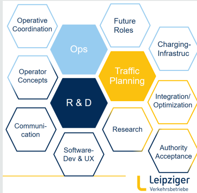
Figure 1: Initial clustering of “Dynaxibility4CE/Flexa wird groß” work packages and attribution to the business units Research & Development, Traffic Planning and Operations Management

Previously there were areas served only every 20 min or less or partially not at all since the street network was impassable for busses.