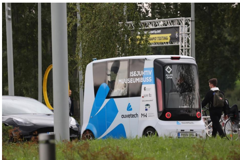
Figure 2: AV-Shuttle Pilot on Tartu (Ride2Autonomy)

With this in mind, Dynaxibility4CE developed a guideline for the CCAM integration in SUMP processes, leading the preparation of an SUMP Topic Guide for CCAM. Based on the existent Practitioner Briefing for Road-Vehicle Automation, developed by the CoExist project on 2019, Dynaxibility4CE thoroughly analysed current support needs and knowledge gaps, cooperating with ongoing projects like ART-FORUM, PAV and Ride2Autonomy.