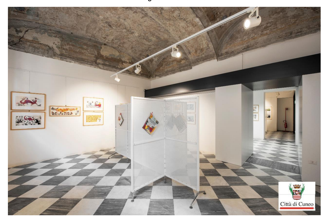
Figure 3: Some rooms