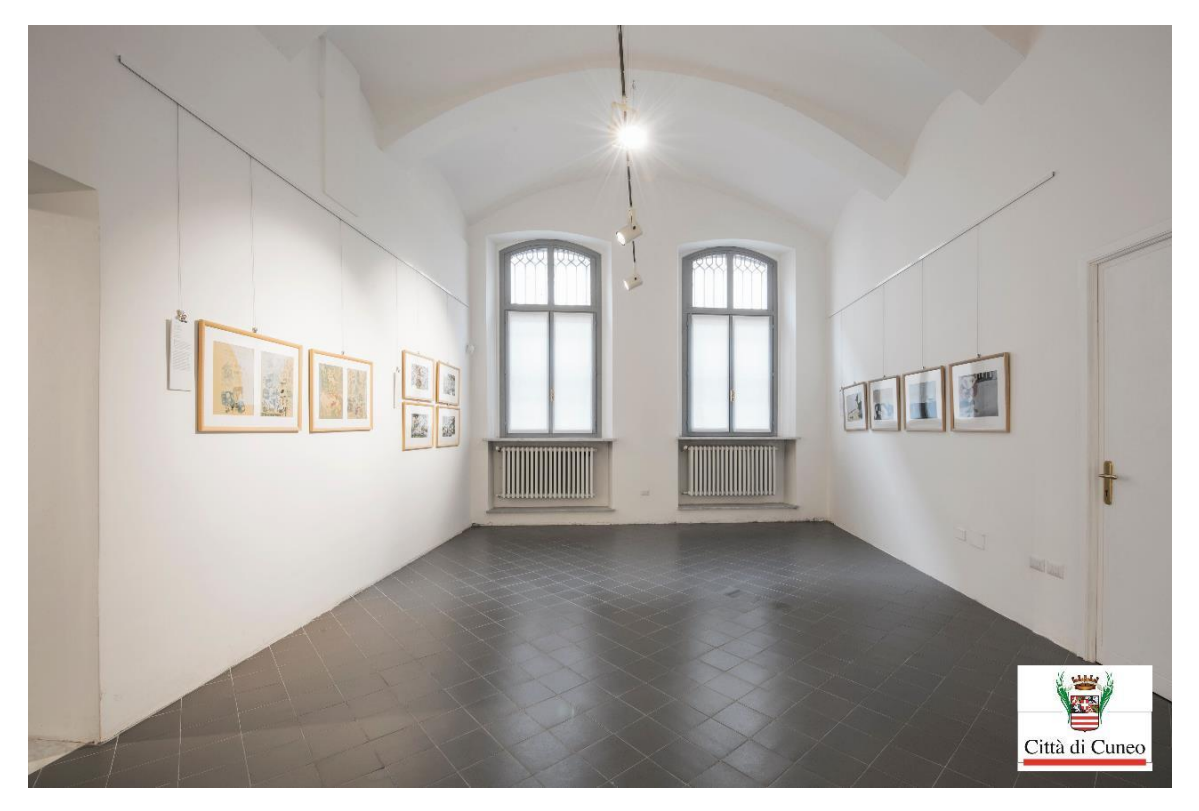
Figure 4: Some rooms