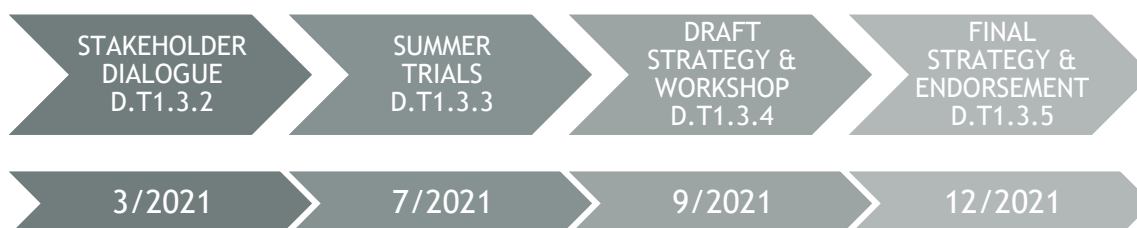
Fig 3 Activity timeline

Further steps for HŽPP, to build on this knowledge gained by these 3 pilot activities, is to engage in a dialogue with local public authorities, NGOs and other PT service providers to discuss the mainstreaming of the concept and inclusion of further towns (other than Ozalj) as destinations, research local interests and analyse economic possibilities. Then, in the summer months of 2021, five trials are to be implemented where different towns are connected through a special train to/from Zagreb, as the capital. The services are to be implemented in close cooperation of stakeholder/s active in the destination. Afterwards, based on the experiences made during previous summer trails, in autumn 2021, HŽPP will upgrade this work paper into a draft strategy and present it at a national stakeholder workshop for feedback and validation of the concept (will be documented in a form of a Report). The final strategy will be prepared and endorsed by the company's decision-makers, by the end of 2021. This document will be prepared for publication on the Regiamobil project website, further transfer and in form of an output factsheet.