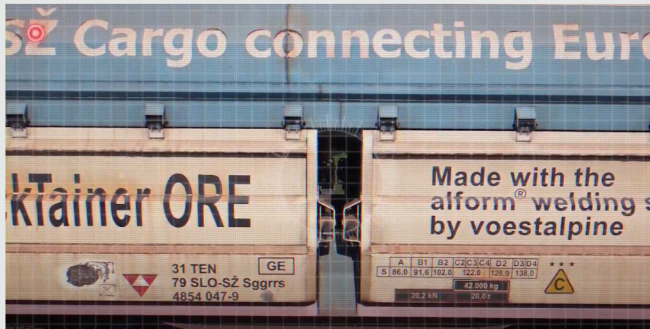
Figure 5: Characters on wagons to be detected and registered