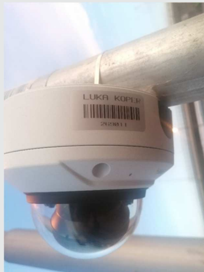
Figure 2: One of the cameras