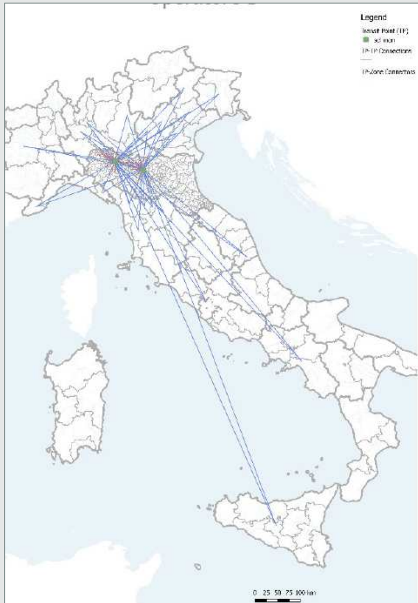
Figure 2 - Network of freight transport operator based in Emilia-Romagna region and implemented in the rail freight model. Pilot action #5 and #8