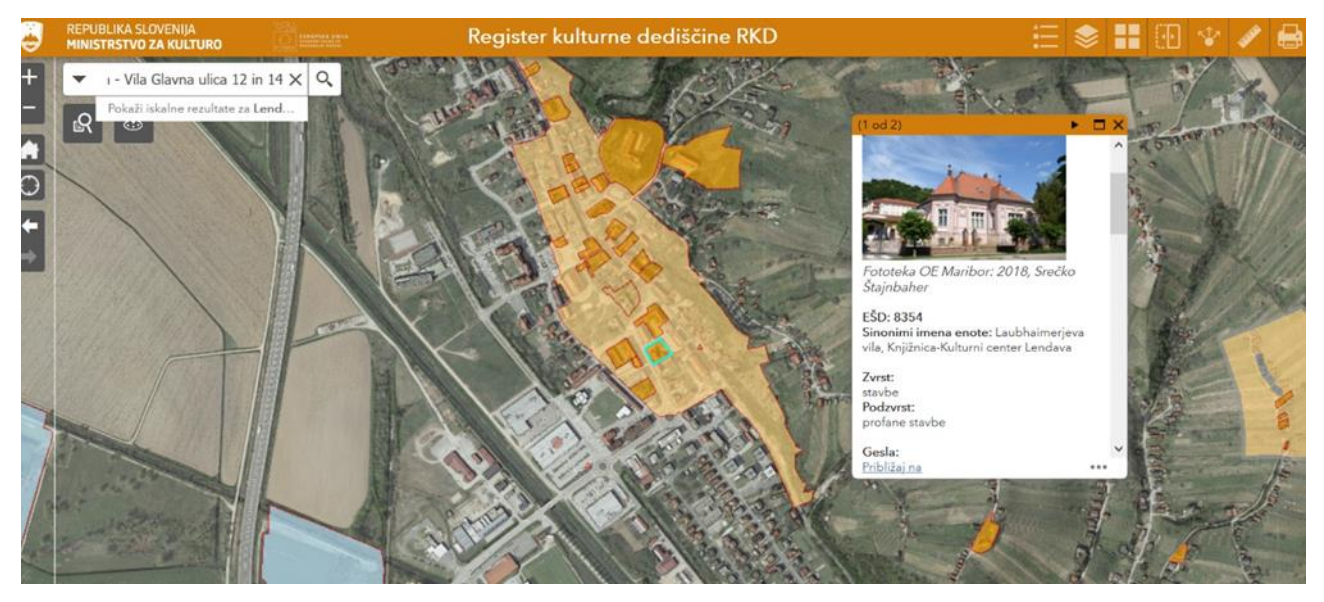
Figure 3: The Public Library in Lendava in the Register of Slovene Cultural Heritage

<u>A building permit is not required for this type of construction work.</u> It is necessary to obtain project conditions and opinions on the PZI (project for the implementation).