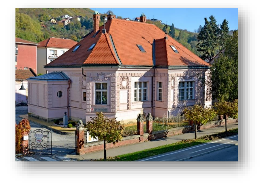
Figure 1: Lendava Library - Oskar Laubhaimer's neo-baroque villa built in 1906

Figure 1 shows the location of Lendava Library - it is located in the Oskar Laubhaimer's neo-baroque villa built in 1906. The building was restored several times. In 1996, the roof was restored. The renovation included the replacement of the roof structure, the replacement of the roofing and the installation of 15 cm thick thermal insulation. The next major renovation was made in 2005, when the basement was completely renovated. The windows are wooden, boxed versions. The building is a cultural heritage and is under the protection of monuments. This means that investments/renovation on the building are limited or under control. The Library employs 10 people, the average daily number of Library visitors is around 45.