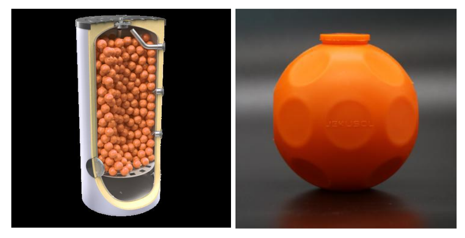
Figure 2: Example of a phase change energy storage tank <sup>8</sup>

The pilot is an innovative investment at national level, such installation has not yet been built anywhere in Slovenia and in this case the pre-investment report will give us clear technical overview/specifications. Clear is that heat exchanger will be installed and temperature sensors will measure the starting and final temperatures. In any case - the investment can serve as an example of good practice in the project area - example of innovative solution of storing renewable energy in an effective way. After the investment an effective monitoring report will be prepared using energy management tool developed to see the results of the investment (CO<sub>2</sub> savings, kWh savings, cost savings, etc.).