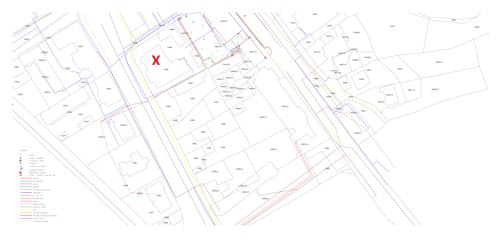
Figure 5: Location of Lendava Library in the center of Lendava<sup>17</sup>