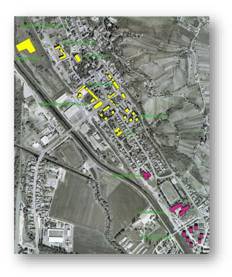
Figure 4: Area of district heating with geothermal energy with all consumers, production and (re)injection well

The entire area of district heating with geothermal energy with all consumers, production and (re)injection well is shown in Figure 4.