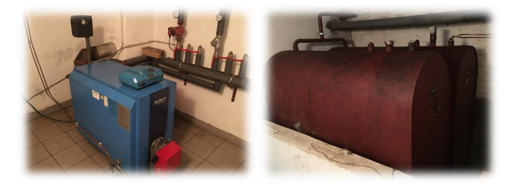
Figure 6: Existing inefficient old heating oil boiler and the heating oil storage tank

this amount to zero. Figure 6 shows the existing inefficient old heating oil boiler and the heating oil storage tank.