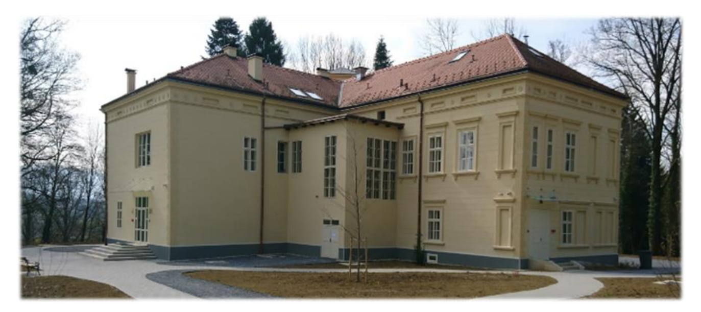
Figure 1: Bračak Manor (Energy Centre Bračak)

In Croatia there are very few examples of good practice, but as an example is recognized Spiritual-Educational Center Mary's Court near Zapresic, and Bracak Manor which is the pilot building in Store4HUC project.