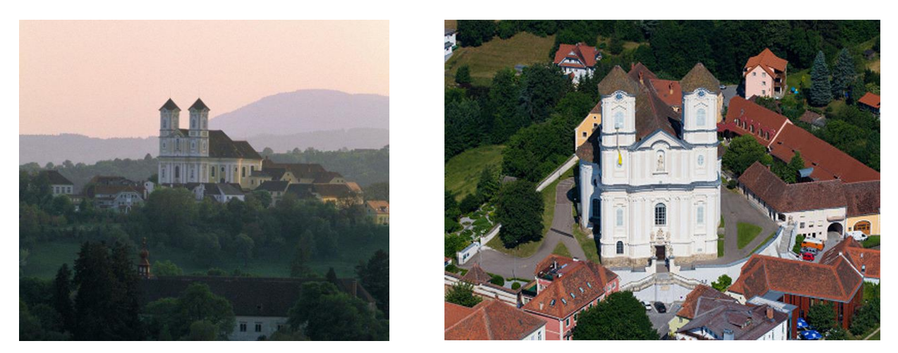
Figure 2: Parish Weizberg<sup>1</sup>

of Weiz. With date of 6 December 2017, the church, was raised to the Basilica Minor, making it the fifth church in the Diocese of Graz-Seckau, which has received this title.