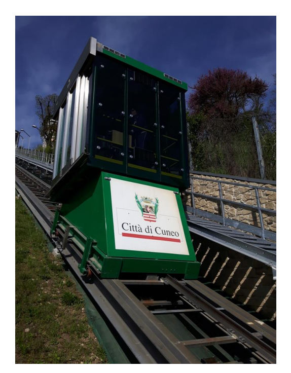
Figure 5: Slope elevator in Cuneo

In Cuneo the project Store4HUC focuses on the energetic optimization of an already existing slope elevator, shown in Figure 5. In average the elevator makes about 160.000 races per year transporting more than 700.000 people. Today the elevator is entirely powered by electricity without using renewable energy. In 2018 the elevator had a consumption of 18.226 kWh of electricity ( 3.584 \in ). Therefore, the purpose of the project is to carry out a pilot project that allows the use of renewable energy for the operation of the elevator system, limiting the energy consumption to a minimum. Through a precise analysis of consumption, the strategy for the realization of the pilot project will be defined, which will see the combination of a photovoltaic system with direct exchange to a part combined with a storage system.