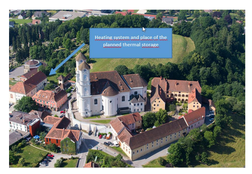
Figure 3: Location of the heating station where the storage will be installed

The parish church of Weizberg, which is under monumental protection, is connected to a district heating grid with a heating load of about 220 kW. The heating station with its four separate transformer stations is located close to the church as shown in Figure 3. Only regional biomass is used as fuel. In course of the project Store4HUC new regulations, heat exchanger, thermostatic valves and a monitoring system will be installed.