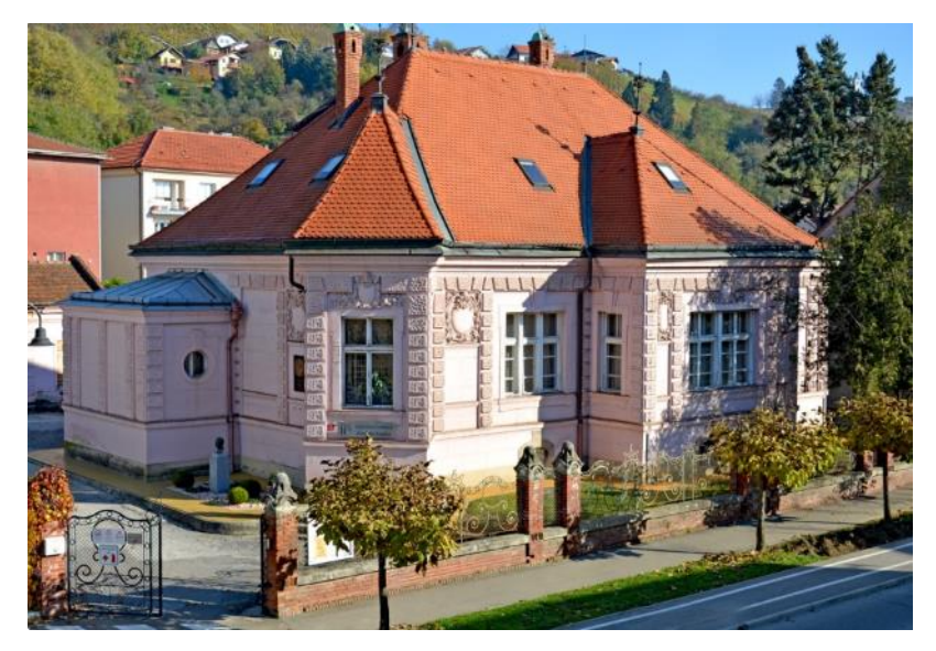
Figure 7: Pilot building in Lendava

The investment in a pilot energy storage system will be the first in the region and at national level. The storage, which will be installed by the municipality in the cultural and historic protected building of Public library of Lendava, shown in Figure 7, will represent a decentralized system of thermal energy advancement in the system with paraffin - latent storages. Municipality of Lendava is one of two Slovenian municipalities that has geothermal district heating, in parallel, the municipality also works on energy efficiency, where there are restrictions on cultural and historical protected structures. Pilot paraffinbased latent storages in connection with geothermal district heating system in Lendava is an innovative investment at the national level, such installation has not yet been built anywhere in Slovenia. Investment can serve as an example of good practice in the project area; example of innovative solution of storing renewable energy in an effective way.