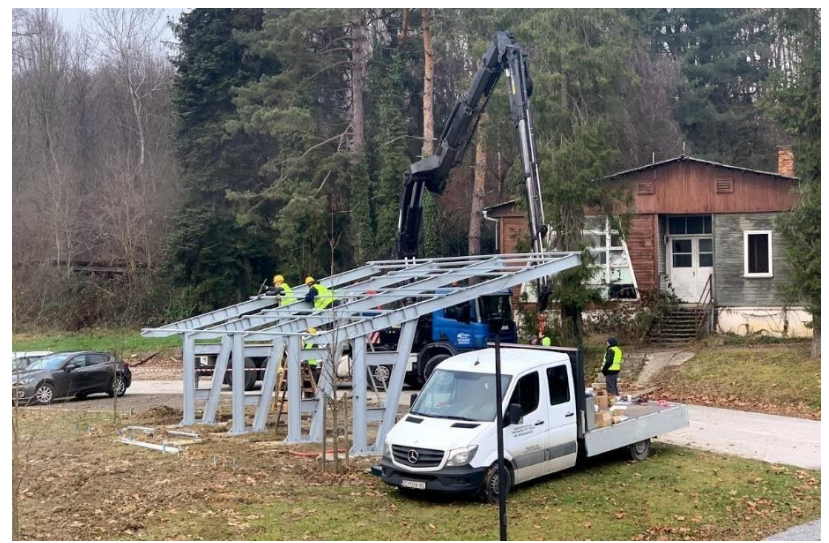
Figure 2: Canopy construction