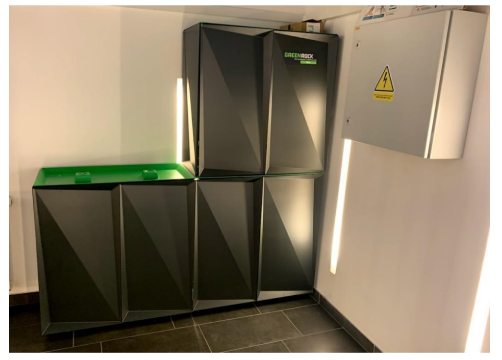
Figure 4: The storage (battery system) is placed in the premises of the Bracak Manor, in the basement next to the stairs