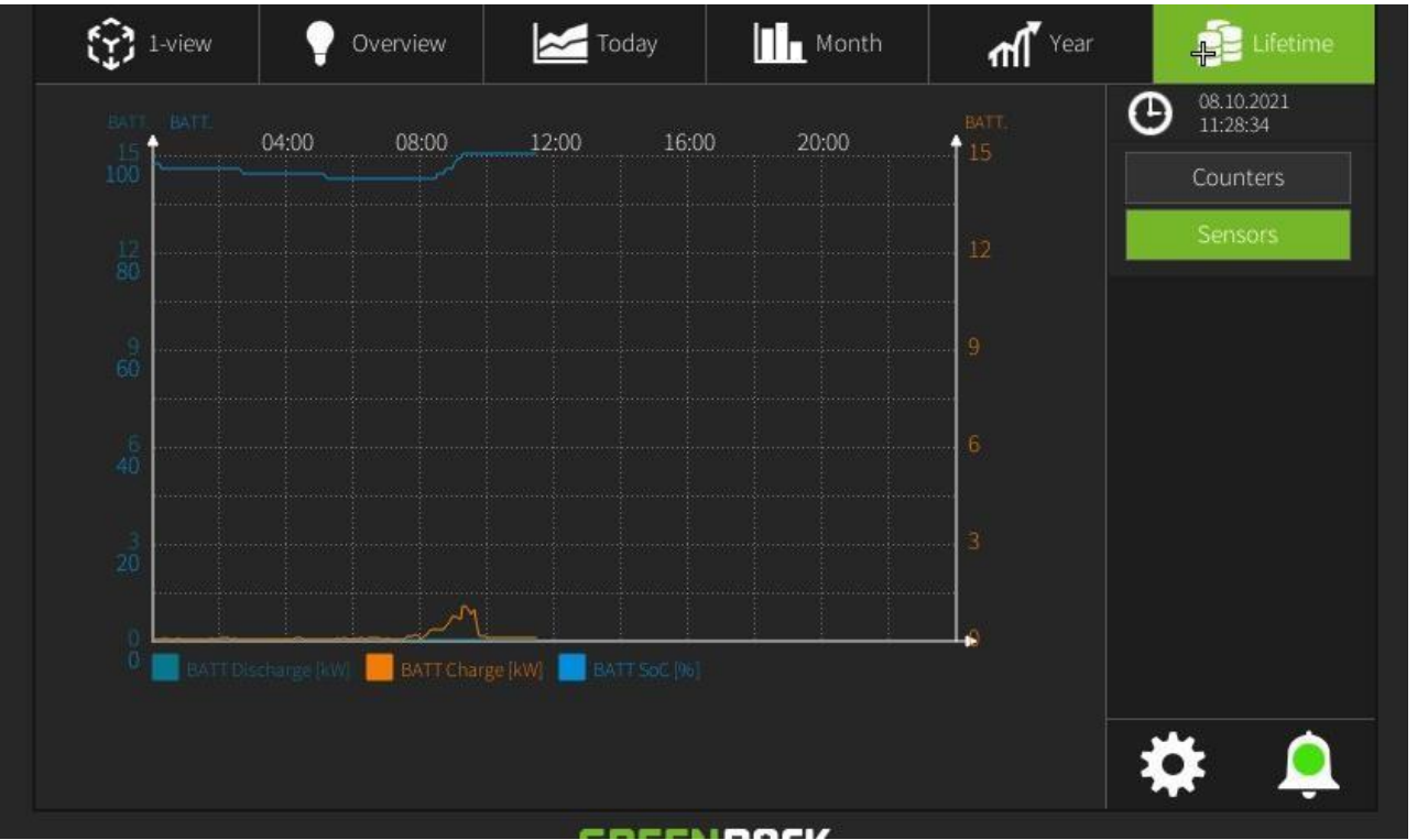
Figure 5: Building management system

Below is given the schedule of all activities through the implementation of the project.