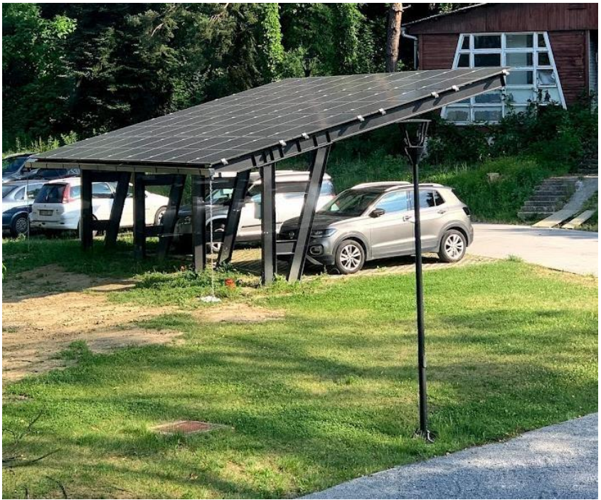
Figure 3: Installed photovoltaic modules

The colour of the canopy was determined by the conservation office. The selected colour is RAL 9017. The roof surface (Figure 3) of the canopy is used to install photovoltaic modules. The canopy has a rectangular roof surface measuring 9,44 x 6,39 meters and a total of 36 photovoltaic monocrystalline modules with a capacity of 300Wp each is installed on it. All technical details of the photovoltaic modules are listed on page 58 of the electrical installation project. It is installed 4 rows with 9 modules, which ensure that the entire roof surface is covered with photovoltaic modules. This means that the peak power of the photovoltaic system is 36 \times 300 Wp = 10,8 kWp. Each photovoltaic module has an associated micro inverter to reduce losses from possible shading during the day.