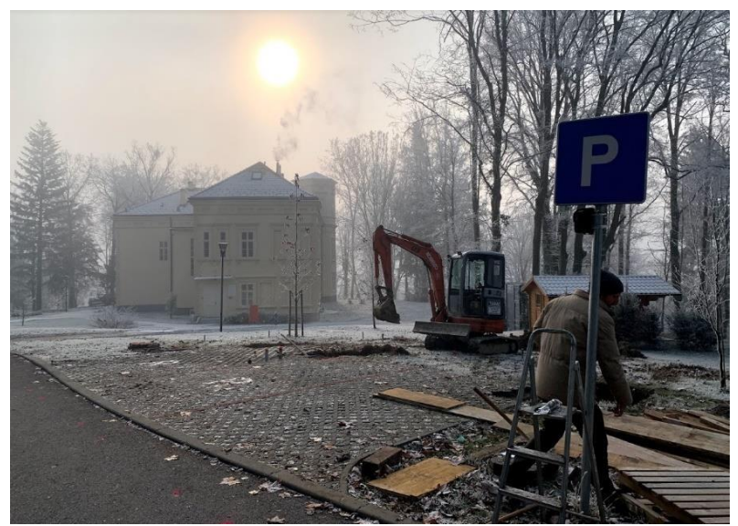
Figure 1: Preparatory works

After the public procurement for the execution of works, a Turnkey Contract was signed with the company Solaris pons d.o.o. and the official introduction to the work was held on November 2, 2020. During November, all preparatory and earthworks for the construction of the canopy were carried out, and a steel structure was delivered to the construction site and the construction of the canopy began and a steel structure was delivered to the construction site and the construction of the canopy began (see Figure 1, and Figure 2).