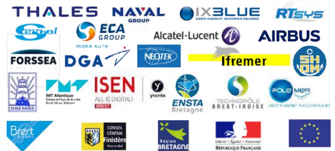
Figure 3: Sea Test Base contributors

education establishments. It aims to foster collaboration between members, particularly between Industry and Research, to facilitate the sharing of expertise and experience, to promote the members' technological skills and expertise and to integrate into a regional and European network.