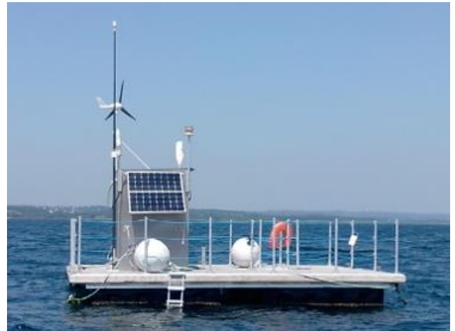
Figure 1: Sea Test Base pontoon

The need for a platform to test marine and submarine equipment emerged in 2008. Stakeholders from industry, research and academia shared their needs, expertise and assets to work together in the design a cost-effective service.