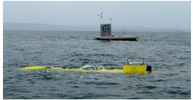
Figure 5: Testing an Unmanned Underwater Vehicle

Over several months in real conditions, this experiment demonstrated the spectral efficiency gain of the MIMO system compared to conventional single-transmitter communication and facilitated the design of a future underwater acoustic modem. This innovative modem will find applications for marine surveillance where the combination of broadband transmission, light equipment and low energy consumption is required, such as environmental data transmission and acoustic surveillance.