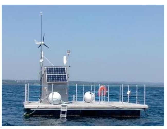
Figure 1: Sea Test Base pontoon

The need for a platform to test marine and submarine equipment emerged in 2008. Stakeholders from industry, research and academia shared their needs, expertise and assets to work together in the design a cost-effective service.