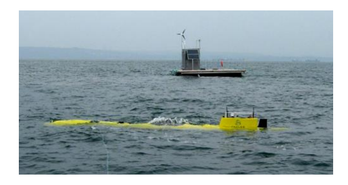
Figure 5: Testing an Unmanned Underwater Vehicle

Over several months in real conditions, demonstrated this experiment the spectral efficiency gain of the MIMO system compared to conventional singletransmitter communication facilitated the design of a future underwater acoustic modem. This innovative modem will find applications surveillance where marine combination of broadband transmission. equipment and low energy consumption required, is such environmental data transmission and acoustic surveillance.