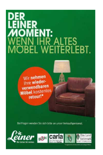
Figure 10: Advertising poster for the pilot project project "Return Furniture Styria"

2012 Online Guide for Repair Shops. An online guide has been set up in order to make it easier for the general public to find qualified repair shops. The technical development of the online-platform was carried out in close cooperation with the Waste Association Tirol Mitte. Subsequently, other federal states have joined this online guide, which is currently used in seven out of the nine Austrian federal states. The use of the online platform is free of charge for both the repair shops offering their services and the general public seeking repair services. It is divided into 12 categories and a number of subcategories. For Styria, the total number of presented repair services currently sums up to ca. 1,900. All registered shops are depicted in an online map and can be searched via this map. For further information see: www.reparaturfuehrer.at/Steiermark.