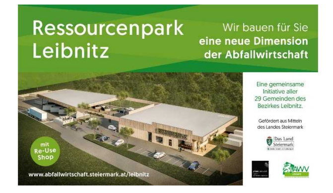
Figure 13: Construction panel for the new "resource park" in Leibnitz

the requirement that a reuse shop or at least a reuse collection corner (in cooperation with a nearby reuse shop) is operated at the resource park. Currently reuse-shops are operated at three Styrian "resource parks". Furthermore, reuse corners for the collection of reusable goods have been established at eight waste collection centres. For further information see: www.abfallwirtschaft.steiermark.at/ressourcenparks.