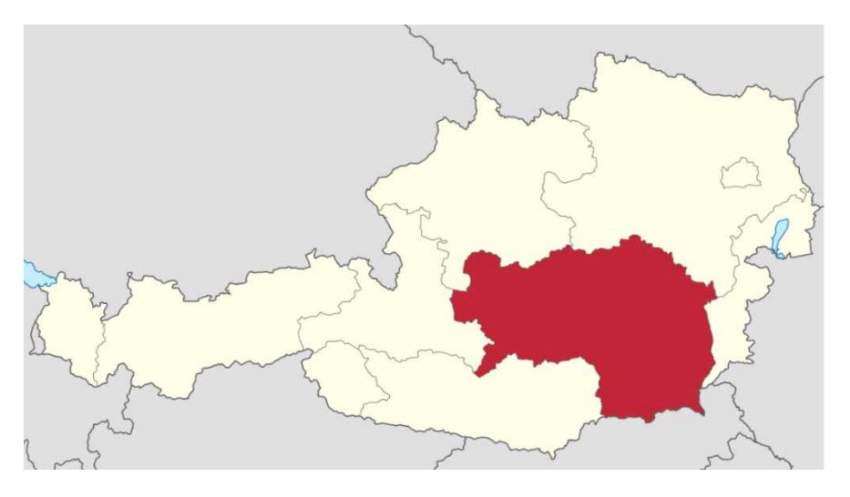
Figure 1: The Austrian federal state Steiermark / Styria.

Steiermark/Styria is the second largest of the nine federal states of Austria. It is located in the southeast of Austria and borders Slovenia. It covers an area of 16,401 km<sup>2</sup> with approximately 1.2 Mio. inhabitants. The northern and western parts of Styria are located in the Alps, whereas the south and southeastern parts are lowland and hill land respectively. The agglomeration of its capital Graz with about 400,000 inhabitants is located in a basin right at the rim of the Alps.