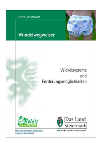
Figure 6: Guide for subsidy of reusable diapers

(For further information see: https://www.abfallwirtschaft.steiermark.at/cms/beitrag/10023264/46597/).