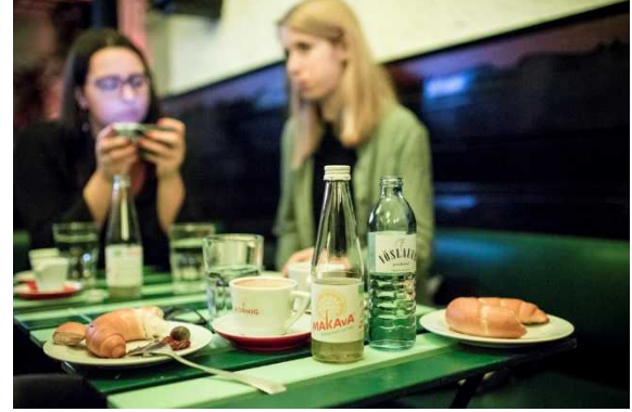
Figure 8: Reuse at the "Diagonale – Festival of Austrian Film"

A new start to the improved anchoring of reuse was made 2010 on the basis of the Styrian Waste Management Plan 2010 and with the aim of improving implementation of the then new five-tier waste hierarchy.