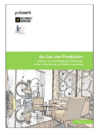
Figure 15: Guide to determining the end of waste when preparing for reuse