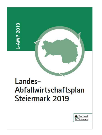
Figure 4: Regional Waste Management Plan Styria 2019

(https://www.abfallwirtschaft.steiermark.at/cms/dokumente/10177492 136114083/c1d2cdf8/LAWP2019-20200125 WEB SRGB.pdf).