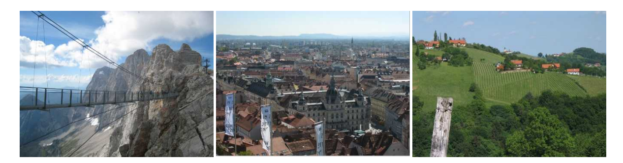
Figure 2: Left: the highest montain of Styria, Dachstein (2.995 m); middle: city center of Graz; Right: hill land with idyllic vineyards in the south