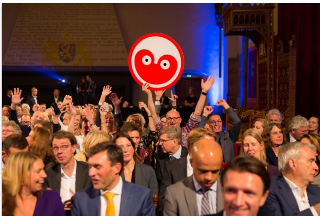
Leeuwarden-Fryslân 2018 in the Ridderzaal, Den Haag/The Hague