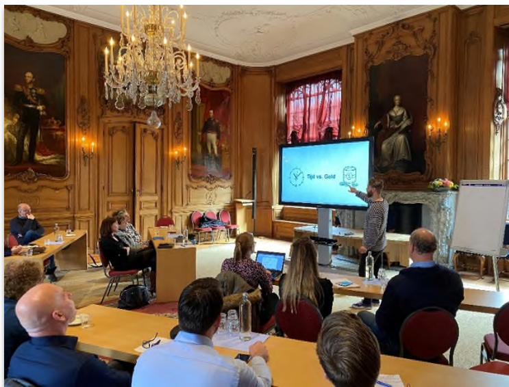
Local Learning Lab 3 (early 2020)

In addition to the Beleidsbrief Europa and the Uitvoeringsagenda Europa of the province, the ECoC-SME project has focused on the Frisian support system for (starting) entrepreneurs. This system is mainly positioned at the Innovatiepact Friesland (IPF) and is comprised of YnBusiness (for existing entrepreneurs) and Founded in Friesland (for start-ups).