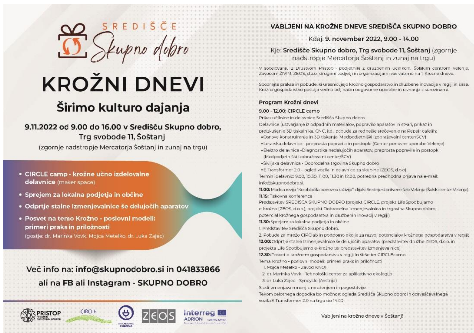
Figure 1: Invitation/poster