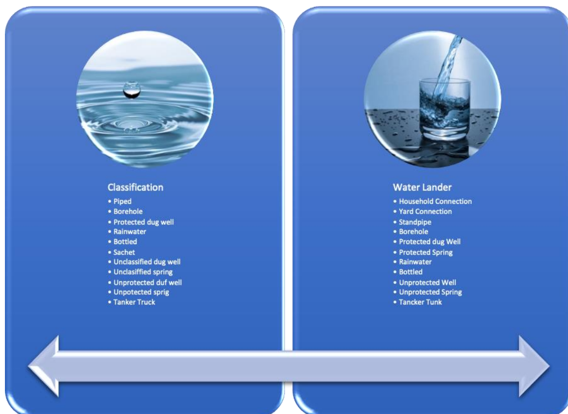
Figure 1. Water types classification.

Color, odor, taste, whole solids and dissolved solids and turbidity are the physical tests for water. The water must be colorless, since any presence of color indicates the presence of minerals such as magnesium and iron. Also, water must be tasteless and odorless, since any