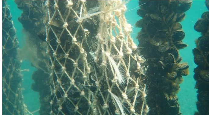
Figure 5: A sock in sisal to grow mussel.

Another viable alternative for replacing traditional plastics in the production of these applications is biodegradable and compostable plastics. Some biodegradable thermoplastic plastics can be processed with the same technology used for traditional plastics, making their production from an industrial point of view relatively simple. At the end of their life cycle, net made from compostable material could be collected and sent to composting plants for the production of quality compost for agricultural use. Moreover, their inherent biodegradability represents a mitigation of the ecological risk in case of dispersion at sea. Pilot studies have been launched in several European countries to reduce the marine plastic pollution generated by the aquaculture sector through the development of innovative biodegradable materials.