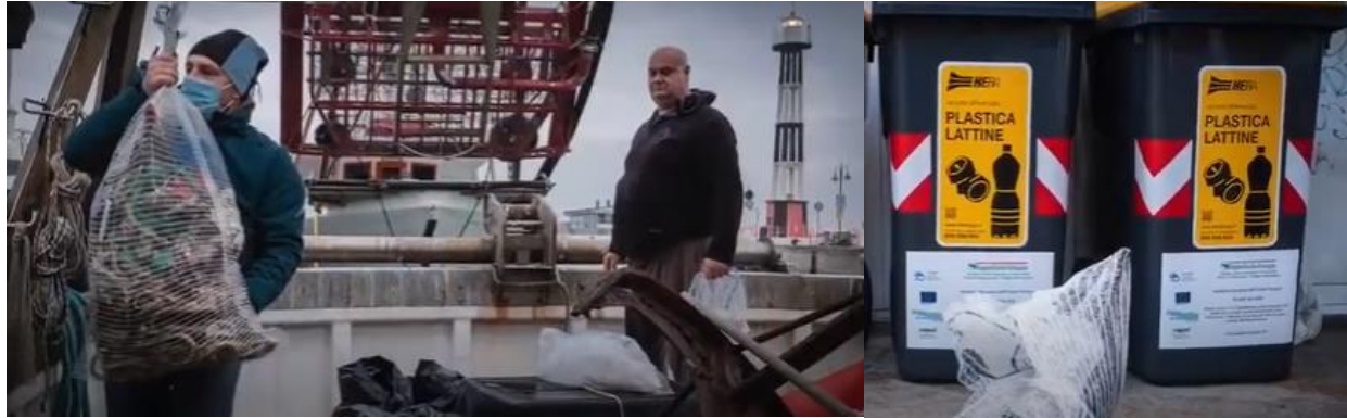
Figure 8: Fishermen landing marine litter at the port of Cattolica and bins intended for the collection of this waste used during the FLAG project.

The suggestions provided by the interviews and the examples of possible solutions in the testing phase and/or already tested, collected in this report could be used design potential strategies and policies to improve the awareness of marine litter and sustain initiatives in finfish and mollusk supply chain aimed to reduce the impact of aquaculture sector on marine litter.