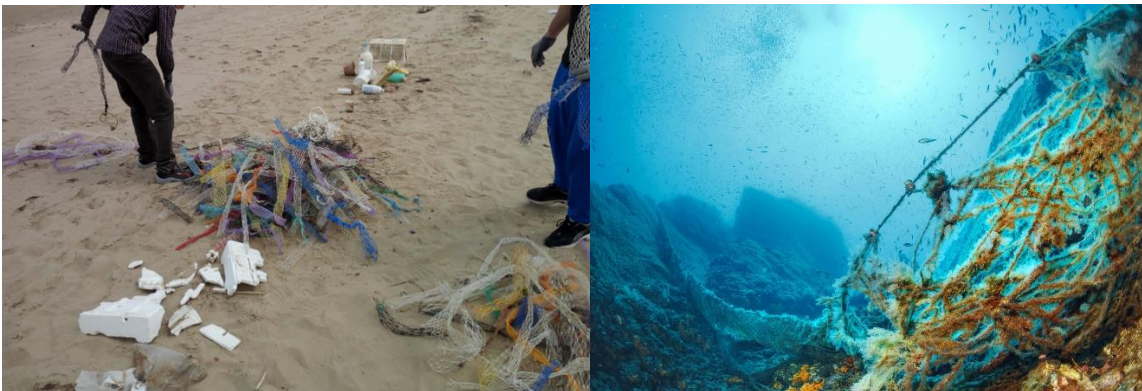
Figure 3: Beach and marine seabed, the two place where see more waste.

Moreover, at the top of the places “where they have seen more this type of marine litter”, there are the beaches followed by the seabed (Fig.3).