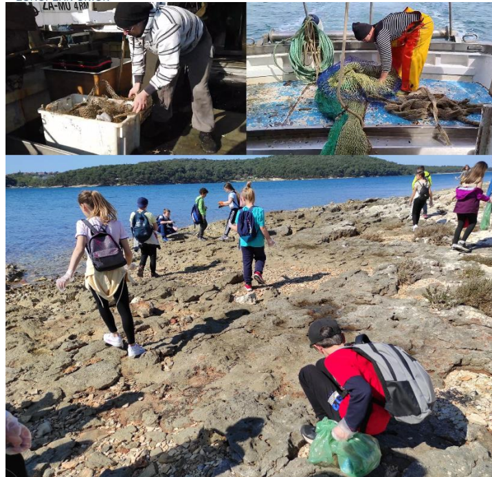
Figure 4: At the top, fishermen who collect waste from the nets; at the bottom; children involved in beach cleaning activities.

The biggest and practical contribution that could come from stakeholders is to replace the plastic materials used with other alternative materials and systems biodegradable/recyclable that is a target of many projects.