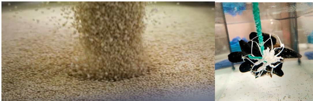
Figure 6: Mater-Bi or biopolymer materials produced by Novamont company partner of the Life_Muscles project.

An EMFF funded European project carried out by Unibo in the Emilia Romagna Region consisted of validating an oyster production protocol in off-shore shellfish farms using bioplastic supports printed by 3D printer and made of PLA polylactic acid and PHB poly- \beta -hydroxybutyrate that have replaced the common baskets used in oyster farms made by polypropylene (Fig.7).