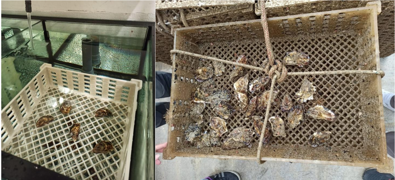
Figure 7: Bioplastic baskets for oyster farming, produced by WASP company during the FEAMP project.

To buffer the problem of marine litter from aquaculture, in addition to these practical solutions upstream of the use of materials in aquaculture with the aim to replace existing ones, there is another point on which action can be taken, downstream of their use: improving the management of marine waste at municipal level.