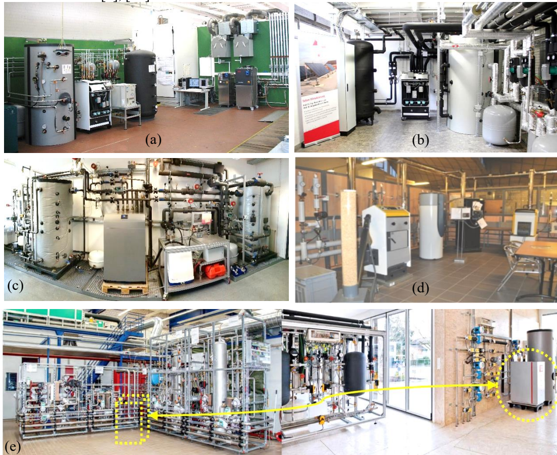
Figure 1 (a) Polygeneration lab in Offenburg University of Applied Sciences (HSO), (b) Solar cooling lab in Karlsruhe University of Applied Sciences (HKA), (c) Trigeneration lab in Koblenz University of Applied Sciences (HSKo), (d) Micro-cogeneration lab in National Institute of Applied Sciences Strasbourg (INSA), (e) Building technologies lab at University of Applied Sciences and Arts Northwestern Switzerland (FHNW)

laboratories and examples of the building automation and control framework can be found in previous works of the authors [9], [10].