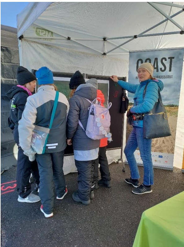
FIGURE 4. ENGAGING YOUNG PARTICIPANTS AT THE WHITEFISH FAIR IN HAILUOTO.