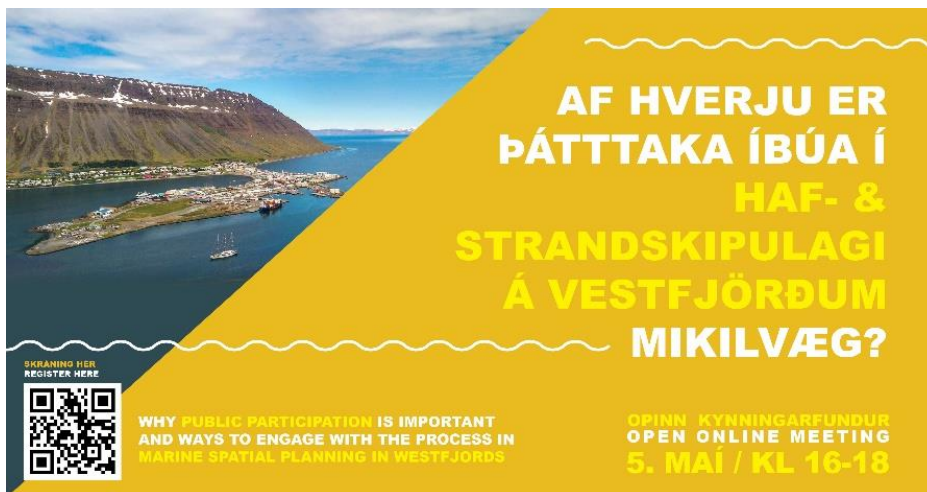
FIGURE 6. INVITATION FLYER FOR THE PUBLIC MEETING IN THE WESTFJORDS

Stakeholders and the community in the Westfjords have been engaged in the COAST project since the beginning. Specifically, a mixed method approach was taken to engage with different experts and community members. Apart from participant observation in the community, key stakeholder interviews were conducted. The interviews were held for the most part in person with a few online meetings and consisted of semi-structured interviews that were recorded and transcribed. For community engagement, a public workshop was conducted for information and discussion. The workshop had to take place online due to the COVID restrictions at the time. It was broadcasted live on Facebook and is available as a recording here . From all of these engagement activities, field notes and transcripts were made that were subsequently coded.