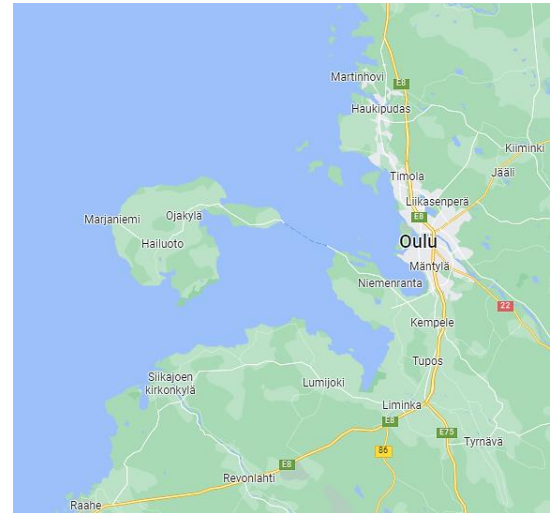
FIGURE 1. HAILUOTO ISLAND IN THE NORTH OF FINLAND.

The natural and cultural environment in Hailuoto is unique (Figure 2 and 3). The rising shoreline is constantly changing and thus forms a living conservation area. Nature is of great value to the islanders, and it is protected with various conservation programmes, in which birds, shore areas and sandy ridges are of specific interest. In summer life on the island is particularly active and lively, and the population doubles. Sustainable tourism is important for the municipality, where officials are strongly committed to sustainable development, to building a better future for nature and generations to come.