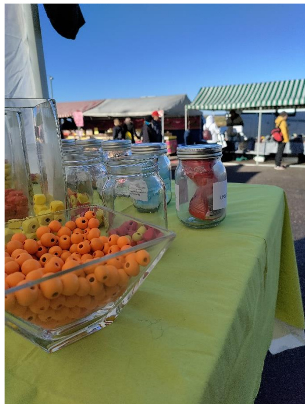
FIGURE 5. ANOTHER ENGAGEMENT ACTIVITY AT THE FAIR.