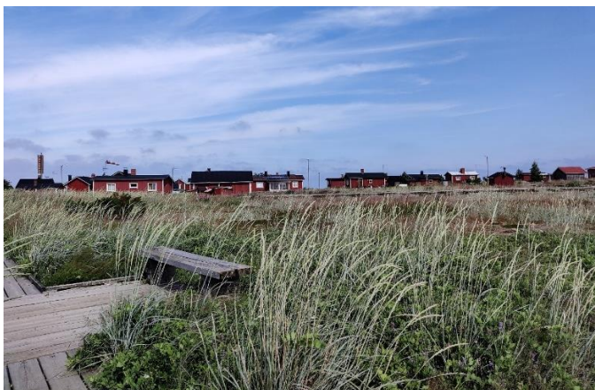
FIGURE 2. A VIEW TOWARDS FISHERMEN'S HUTS IN MARJANIEMI IN HAILUOTO.