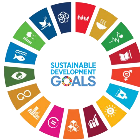
FIGURE 4 ÍSAFJÖRÐUR IN THE WESTFJORDS & UN SUSTAINABLE DEVELOPMENT GOALS