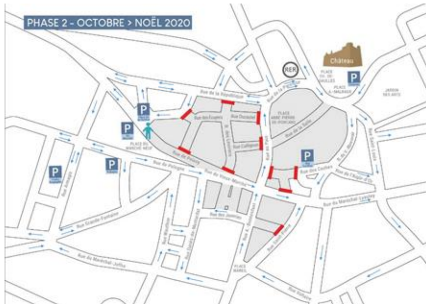
Phase 2 of the pedestrianisation of the hypercenter (October 10 th until today)

This pilot action also contributed to the development of the Safely Connected EIT Urban Mobility project last year, and it resulted in the permanent reconfiguration and pedestrianisation of a part of the rue de Poissy (in blue on the picture below).