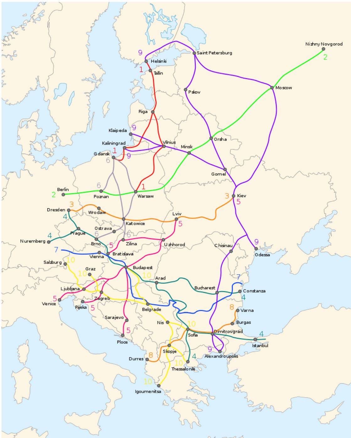
Elements of the trans-European transport network (TEN)