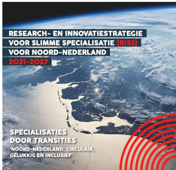
Figure 1 Cover page of the RIS3 North Netherlands 2021 – 2027.

The interregional learning process gave the province of Fryslân and regional Delta Lady stakeholders insight in the best practices of the partners in other EU regions. Based on the lessons learnt we have defined three actions. With the implementation of these actions, we will enhance the focus of the RIS3 2021-2027 on the delta's ecosystem services and their potential and subsequently improve the development of the economy in the region.