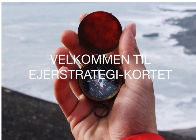
Picture displaying the frontpage of the website.

More than 13,000 owner-managers have taken the survey and more than 5,000 owner-managers in Denmark have downloaded a personal report 6 .