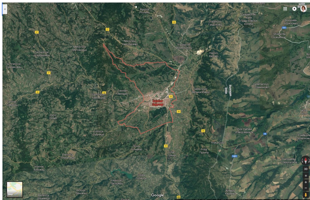
Figure 1. Location of Zajecar

Location of Zajecar in Serbia is presented on the following figure.