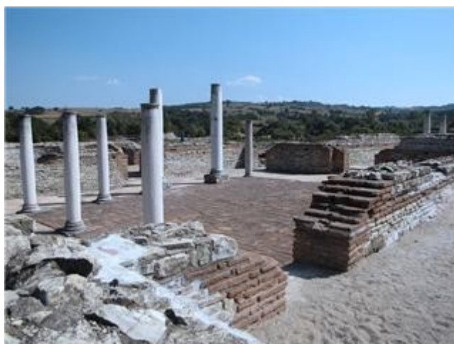
Figure 2. The remains of Felix Romuliana

The geographical, administrative, economic, political and cultural centre of the Zajecar district and the Timok region is the city of Zajecar. Three Roman emperors were born in the Zajecar district. Felix Romuliana is located in Gamzigrad, one of the world's most famous archaeological sites. It is the palace of the Roman Emperor Gaius Galerius Valerius Maximianus, from the late third and early fourth centuries of the new era, rich in jewellery, mosaics, coins, tools, weapons and other objects from that period. On the hill near the fortress is a sacral complex where the Emperor Galerius and his mother Romula are buried.