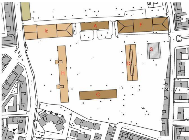
Plan 2 - Rossani barracks project