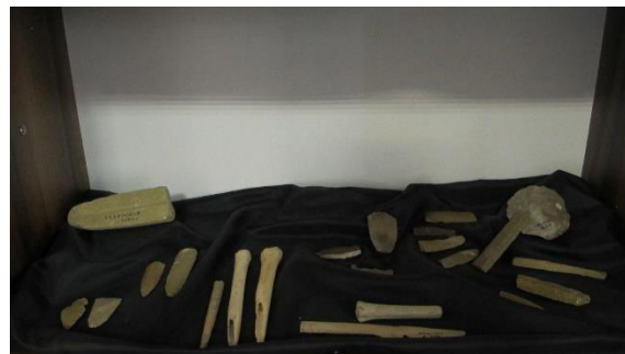
Tools found in the Durankulak Archaeological Complex, Hamangia III culture, 5th millennium BC.