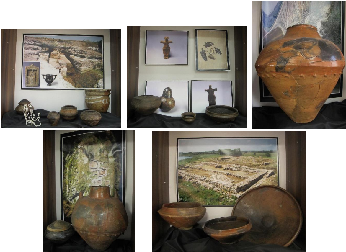
Ceramic vessels found in the Durankulak Archaeological Complex, Hamangia III culture, 5th millennium BC.

same orientation in a constricted position to the left or right. Signs of a funeral feast are increasingly found around the graves, continuing the practice of the heads of large herbivores serving for these purposes. During these feasts, large ceramic vessels with extensively cut decorations were also broken, and sometimes their pieces were also laid in graves. Symbolically, the dead are included in the feasts, with small vessels of food or drink placed over their mouths. The idea of symbolism is clearly evident from the fact that, especially for funerals, smaller copies of real vessels that are poorly baked are prepared (Todorova 2002). The first symbolic graves appear - in them the remains of a dead man are missing. They are designed to soothe the spirit of a member of the community, who died or was deceased away from his relatives.