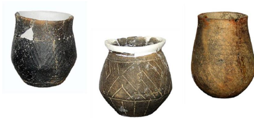
Cernavodă, Mangalia, Limanu - ceramics

between ceramic objects used in daily life and those intended for funerary rituals. The diversity of modeling techniques and the distinctive decoration of Hamangia ceramics reflect a refined artistic sensibility 7 .