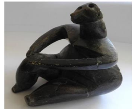
Cernavodă - The Thinker and the woman sitting