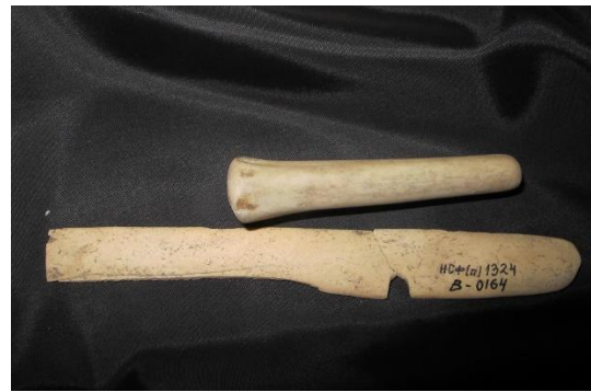
Tools found in the Durankulak Archaeological Complex, Hamangia III culture, 5th millennium BC.

The complex relationships that have arisen are radically changing all spheres of the prehistoric communities. The domestic industries that existed until then are turning into crafts. Occupations emerge - the members of the society start individual activities related to different aspects of the economic system. The mass production is starting - the production of uniform or similar products in a series to satisfy the need for similar products by a narrower or wider range of consumers. The beginnings of this system date back to the Neolithic, but it was finally formed during the Copper Age, when the “massification” of production affected not only metallurgy but pottery, weaving, mineral processing, bone production and jewelry from shells of marine