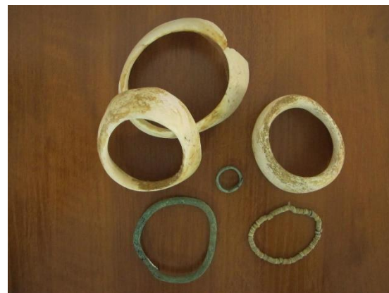
Jewelry and Tools found in the Durankulak Archaeological Complex, Hamangia III culture, 5th millennium BC.

Thus, in a relatively short period of existence - of the order of about 600 years - an archaeological culture passes its metamorphosis from an archaic and backward