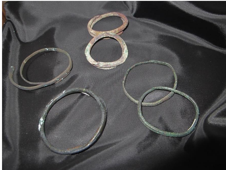
Jewelry found in the Durankulak Archaeological Complex, Hamangia III culture, 5th millennium BC.

The final, fourth phase of the Hamangia culture is one of the most well-researched territorial and chronological phenomena on the territory of Bulgaria. Although there are still no summary publications on it, the picture of the development of the late Hamangia society, which lived during the Middle Chalcolithic era, can be reconstructed with high reliability and detail.