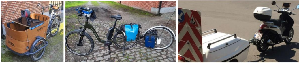
Measuring technologies. a A profilometer. b Comfortbike. c Drivenby.

Three different mobile devices have been used on five different road sections that are located in the Province of Antwerp in Belgium. The devices are shown below.