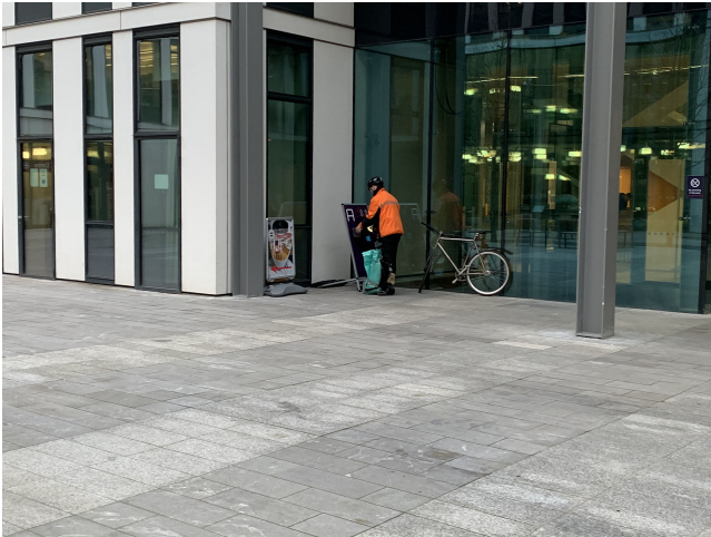
Figure 6: The courier has arrived at a hub and placed the lock-box onto the hub

was initiated within the studio space, with research staff present. Subsequent contracts were initiated – and received by couriers via the GeoPact App – at the end point of the previous contract. So, couriers would receive a request to participate in the next contract either at a reception or at a hub where they had made their previous drop. Couriers were interviewed immediately after the enactment session and reception staff were interviewed on subsequent days. The Zedify franchisee and manager for Glasgow and Edinburgh, observed the second enactment session on the final day, and was interviewed directly after the final courier. While research team members were stationed to observe and assist at receptions and hubs, the findings in this study are drawn solely from participant interviews.