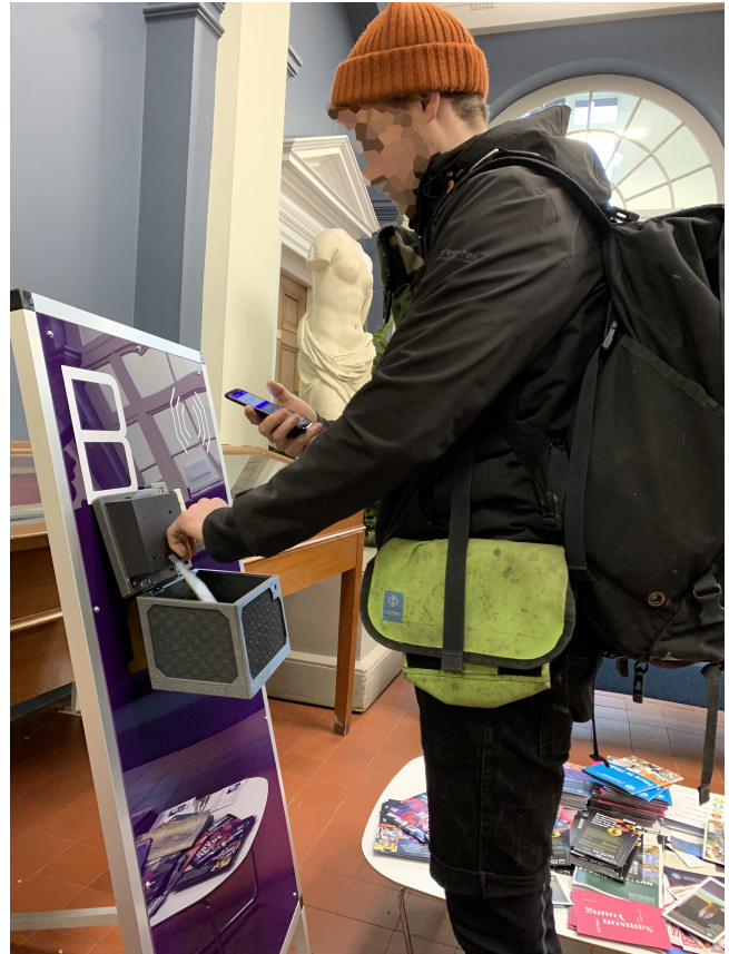
Figure 4: The courier has unlocked a box at a hub and drops the package into it

This study took place in Scotland (UK) and ran over three days, with individual couriers participating in either a morning or afternoon session, in which deliveries were enacted using GeoPact. The research team sent packages from a studio space, across the University of Edinburgh, to be received either by a receptionist or left at a hub (as detailed above). The study participants were aware that these packages did not contain items of value and were not considered ‘real’ deliveries. However, they understood that for this trial we were asking them to treat them as real. Distances between the pick-up point and drop-off were between buildings, and deliberately short (max 10mins journey) as we were interested in experiences of handovers rather than journeys. All couriers completed all four contracts described above in the same sequence. The first contract