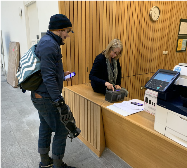
Figure 3: The receptionist pushes the button on the box to confirm she has received it, this action together with the colocation will unlock the box

box locks, and they are instructed to return the box to the courier. The courier keeps hold of the box for their next delivery. In this contract the courier has no contact with the item. The deliveries in contracts shown in figures 2a, 2b, 2c and 2d work in a similar way. In the person-to-hub contract the courier picks up an item directly from the sender, transports the item and drops it to a box at a hub (see figure 4). In the hub-to-person the courier collects an item from a hub and transports it to the recipient. Notable in these two contracts is that the lock-box stays locked to the hub and the item is not transported inside it. Finally, in the hub-to-hub contract the courier picks up a box at one hub (see figure 5) and drops it at another hub (see figure 5).