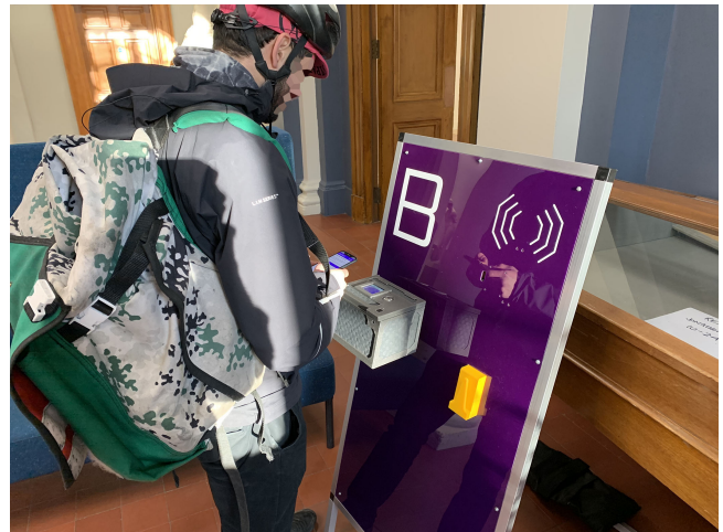
Figure 5: The courier has arrived at a hub and is instructed to collect the lock-box